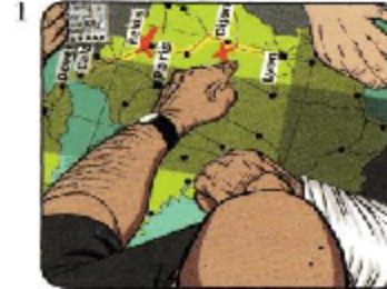
Gary is saying

2 What are they saying? Write the right answers in the spaces