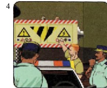
The policeman is saying