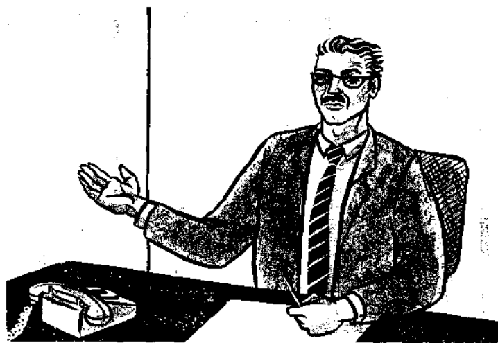
'I want to live in a big house, with lots of rooms . . .'

'Oh, but I want more than that. I hate housework. I want lots of people to clean the rooms and bring me food. I want to have a lot of money in the bank. Oh,