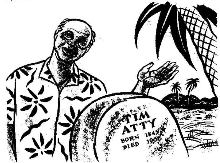
'Some people say he was the houngan, Baron Samedi.'

'I see you know more about voodoo than I thought,' he said. 'But don't be afraid of me. I'm just an old man who doesn't like the new world.' He smiled at Karen again.