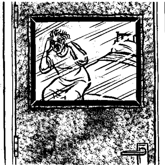
'He has a big place to live in, with lots of rooms . . .'

Kee looked at the man in the bed. It was Conway. He was wearing a big white coat, and he was screaming. While Kee was looking at the man, Karen explained. 'His name is Conway, James Conway. It's strange. When I came to Haiti, we were on the same plane. He sat next to me. He wanted to start a business and make money. I didn't like him very much, I can tell you, but he wasn't mad. Look at him now. He's mad, and we don't know why. He doesn't talk to anyone and he starts screaming when he hears a telephone or a bell ringing. He's afraid of sleeping too, and we can't