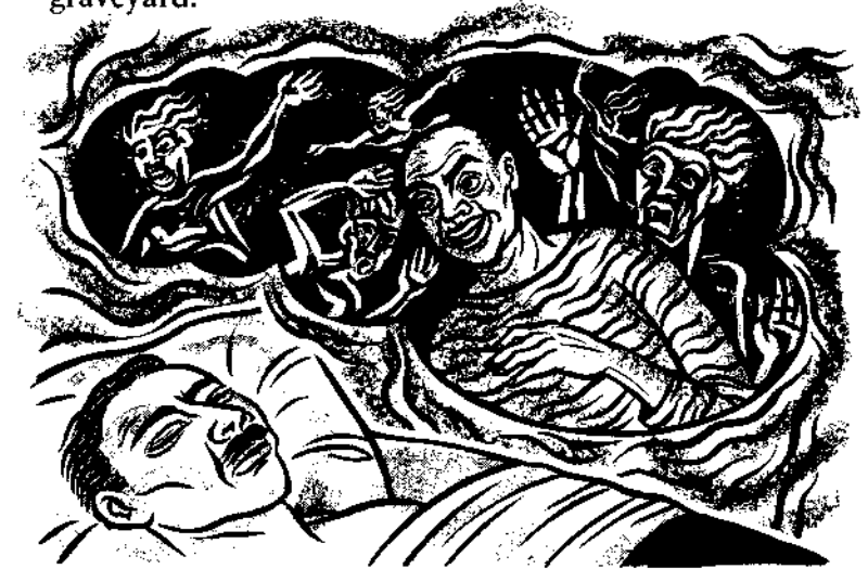
In his dream, Conway saw the spirits from the graveyard.

RRRRING! It was seven o'clock. Conway looked at his clock and got out of bed. He brushed his teeth. He was very tired after his bad night. But he washed his face with cold water, and he began to feel much better. He soon forgot about his dreams of Kee and the graveyard.