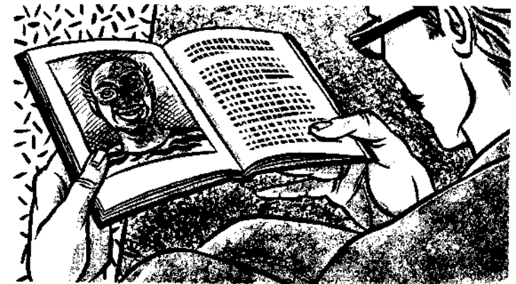
Baron Samedi, the strongest of the voodoo houngans.

‘Baron Samedi, the strongest and most dangerous of all the voodoo houngans. No one knows who Baron Samedi is, but they believe he is both dead and alive. He lives in two different worlds. Many people are so frightened of him that they are afraid to say his name.’