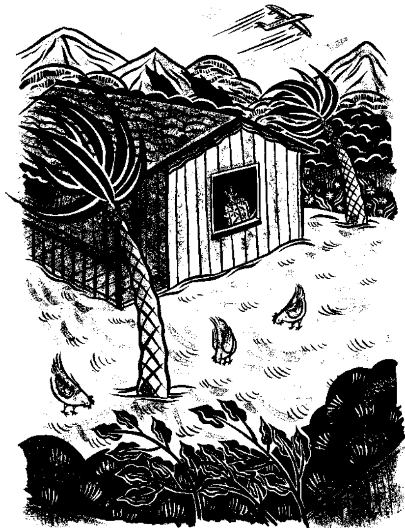
Kee was in his small wooden house among the trees.

'I can feel danger,' he thought. 'Someone bad is coming.' He looked out into the trees, but he couldn't