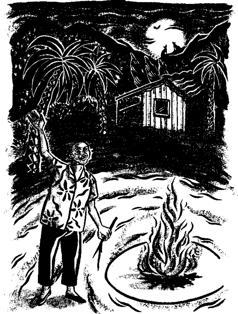
'Spirit of the wind, something bad must happen to Conway.'

Kee began to talk very quietly. He said, 'Spirit of the