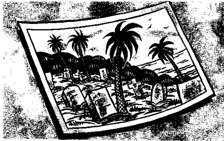
'I want to build on this graveyard.'

Jacques looked at the photograph carefully. 'It's very