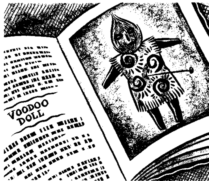
'The doll's face is a coconut, and there's a pin in its stomach.'

'Yes, I do. We don't really understand voodoo in