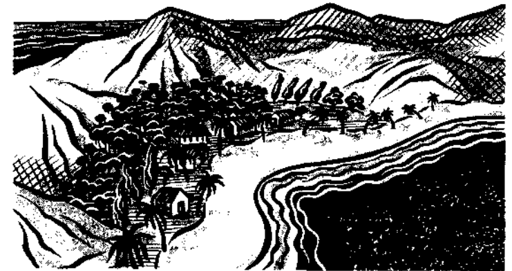
The coconut trees were moving slowly in the wind.

'It looks beautiful, doesn't it?' Conway looked at the