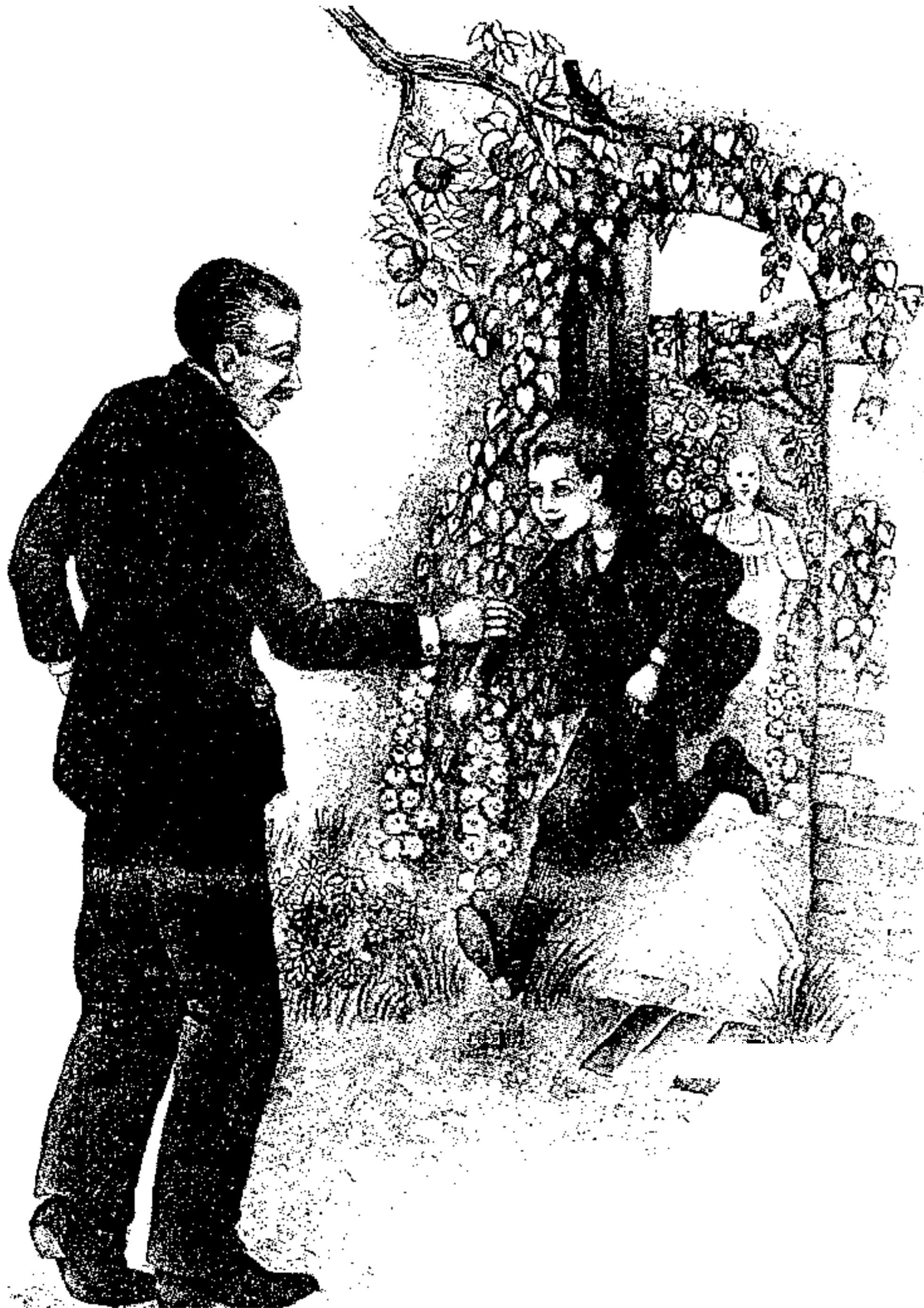
A boy ran out, a tall, healthy, handsome boy, straight into the man's arms.

And so, that afternoon, Mrs Medlock, Martha, and the other servants had the greatest shock of their lives. Through the gardens towards the house came Mr Craven, looking happier than they had ever seen him. And by his side, with his shoulders straight, his head held high and a smile on his lips, walked young Colin!