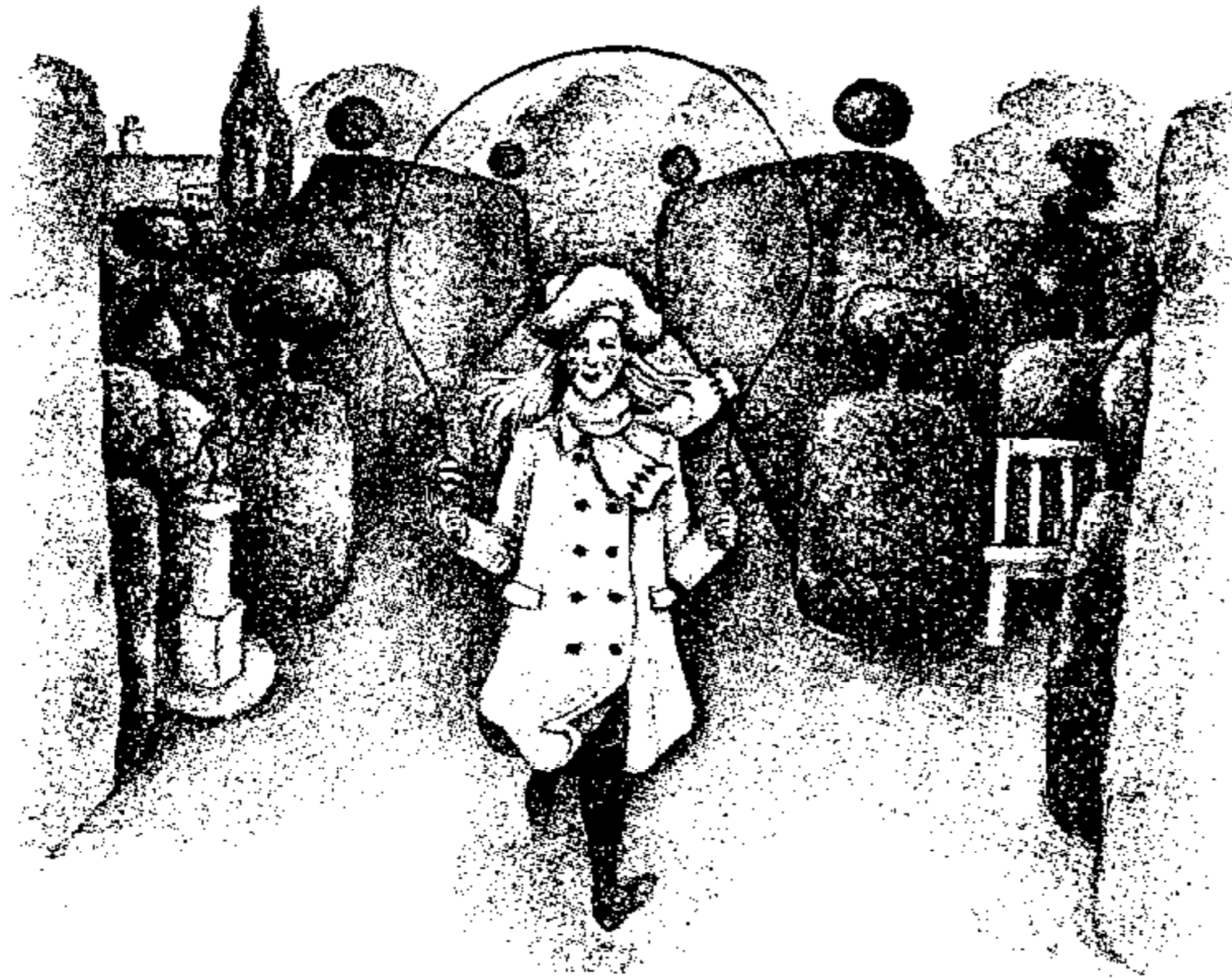
Mary skipped and counted until her face was hot and red.

skipped, skipped and counted, until her face was hot and red. She was having more fun than she had ever had before. She skipped through the gardens until she found Ben Weatherstaff, who was digging and talking to his robin. She wanted them both to see her skip.