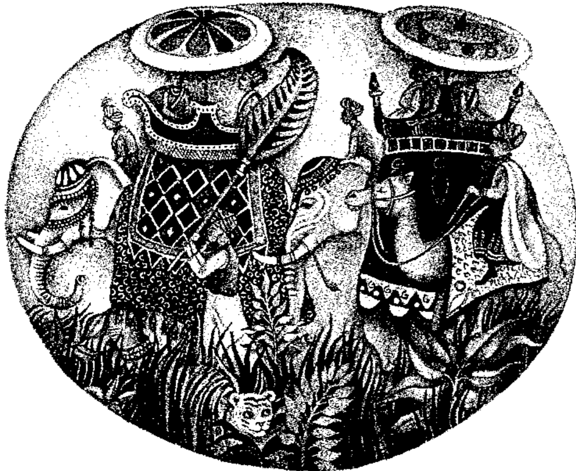
They'd like to hear about riding on elephants and camels, wouldn't they?'

'Oh, that would be kind of you, miss! And look, Mother has sent you a present!'