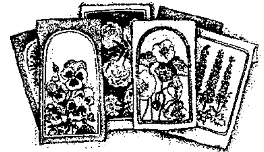
'Dickon can get you some seeds to plant.'

As the door closed behind Martha, Mary thought to herself, 'This really is the strangest house that anyone ever lived in.'