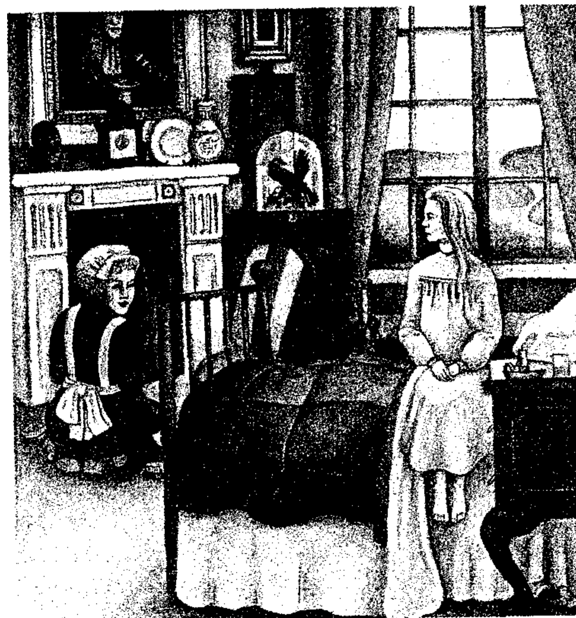
Martha stopped cleaning, and stared at Mary.

Little Miss Mary was furious with Martha. 'It's different in India where I come from! You don't know anything about India, or about servants, or about anything! You ... you ...' She could not explain what she meant. Suddenly she felt very confused and lonely. She threw herself down on the bed and started crying wildly.