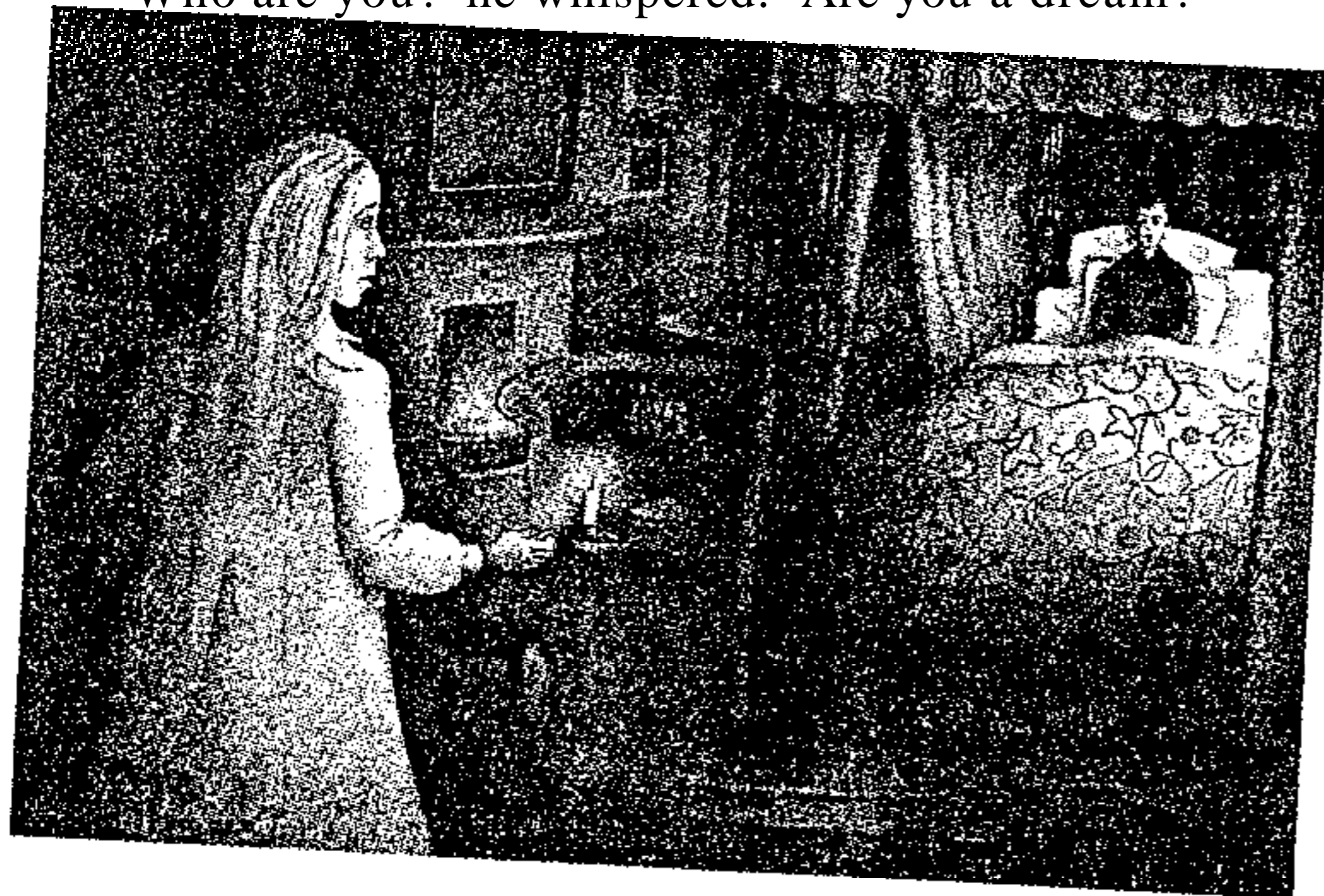
'Who are you?' the boy whispered.

'Who are you?' he whispered. 'Are you a dream?'