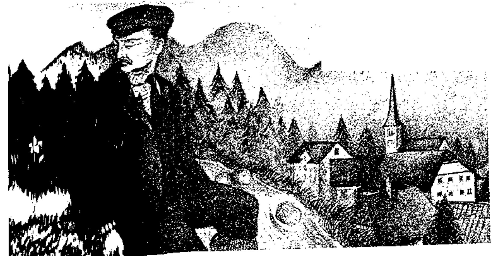
But one day, as he sat by a mountain stream, he actually looked at a flower.

But one day, as he sat by a mountain stream, he actually looked at a flower, and for the first time in ten years he realized how beautiful something living could be. The valley seemed very quiet as he sat there, staring at the Mower. He felt strangely calm.