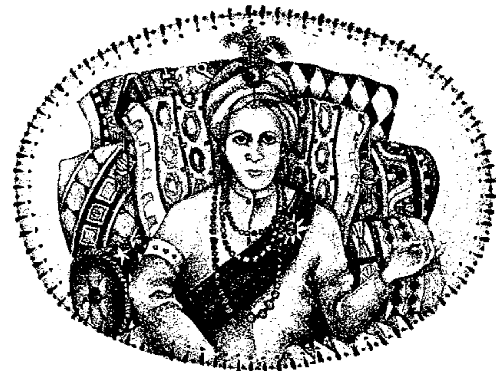
To Mary he looked just like an Indian prince.

'Oh, I'm sorry, sir,' said poor Mrs Medlock to the