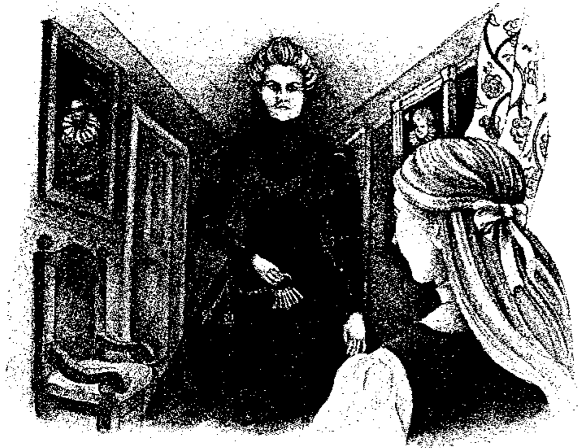
Just then Mrs Medlock appeared.

The next day it was very rainy, so Mary did not go out. Instead she decided to wander round the house, looking into some of the hundred rooms that Mrs Medlock had told her about. She spent all morning going in and out of dark, silent rooms, which were full of heavy furniture and old pictures. She saw no servants at all, and was on her way back to her room for lunch, when she heard a cry. 'It's a bit like the cry that I heard last night!' she thought. Just then the housekeeper, Mrs Medlock, appeared, with her keys in her hand.