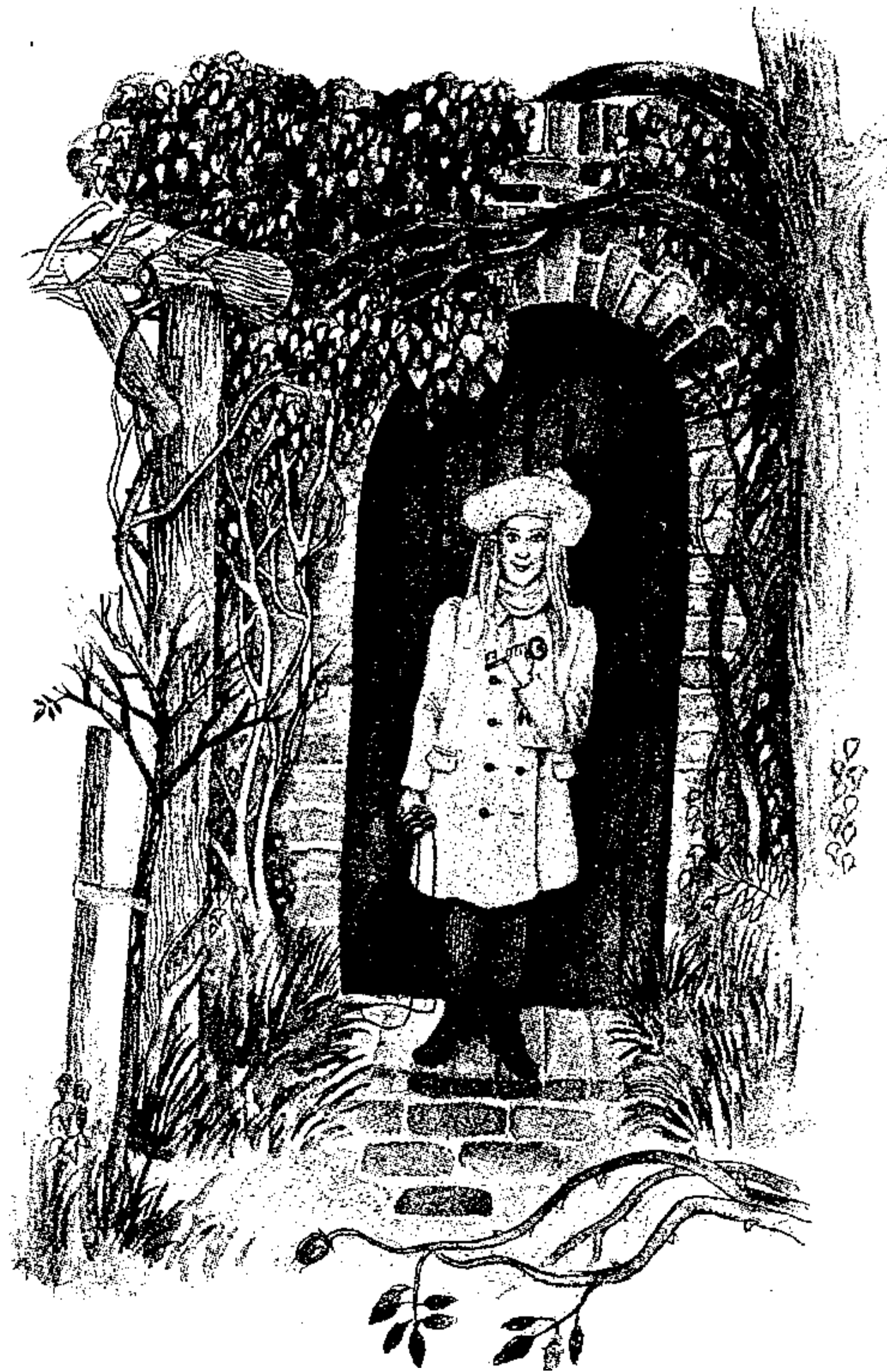
It was the loveliest, most evening place Mary had ever seen

She almost forgot about lunch, and when she arrived back in her room, she was very hungry and ate twice as much as usual. 'Martha,' she said as she was eating, 'I've been thinking. This is a big, lonely house, and there isn't much for me to do. Do you think, if I buy a little spade, I can make my own garden?'