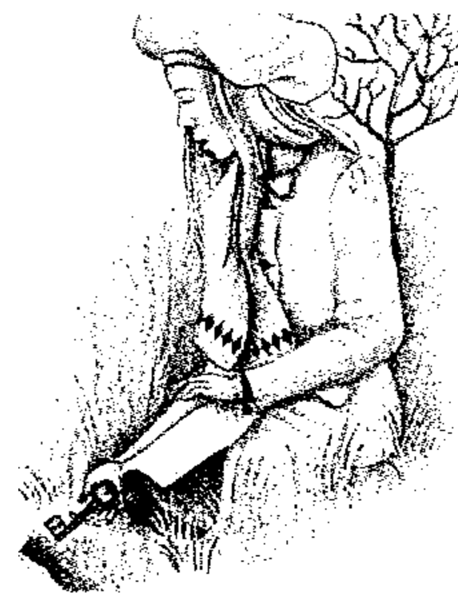
It was an old key.

She looked at it for a long time. How lovely it would be to find the garden, and see what had happened to it in the last ten years! She could play in it all by herself, and nobody would know she was there. She put the key safely in her pocket.