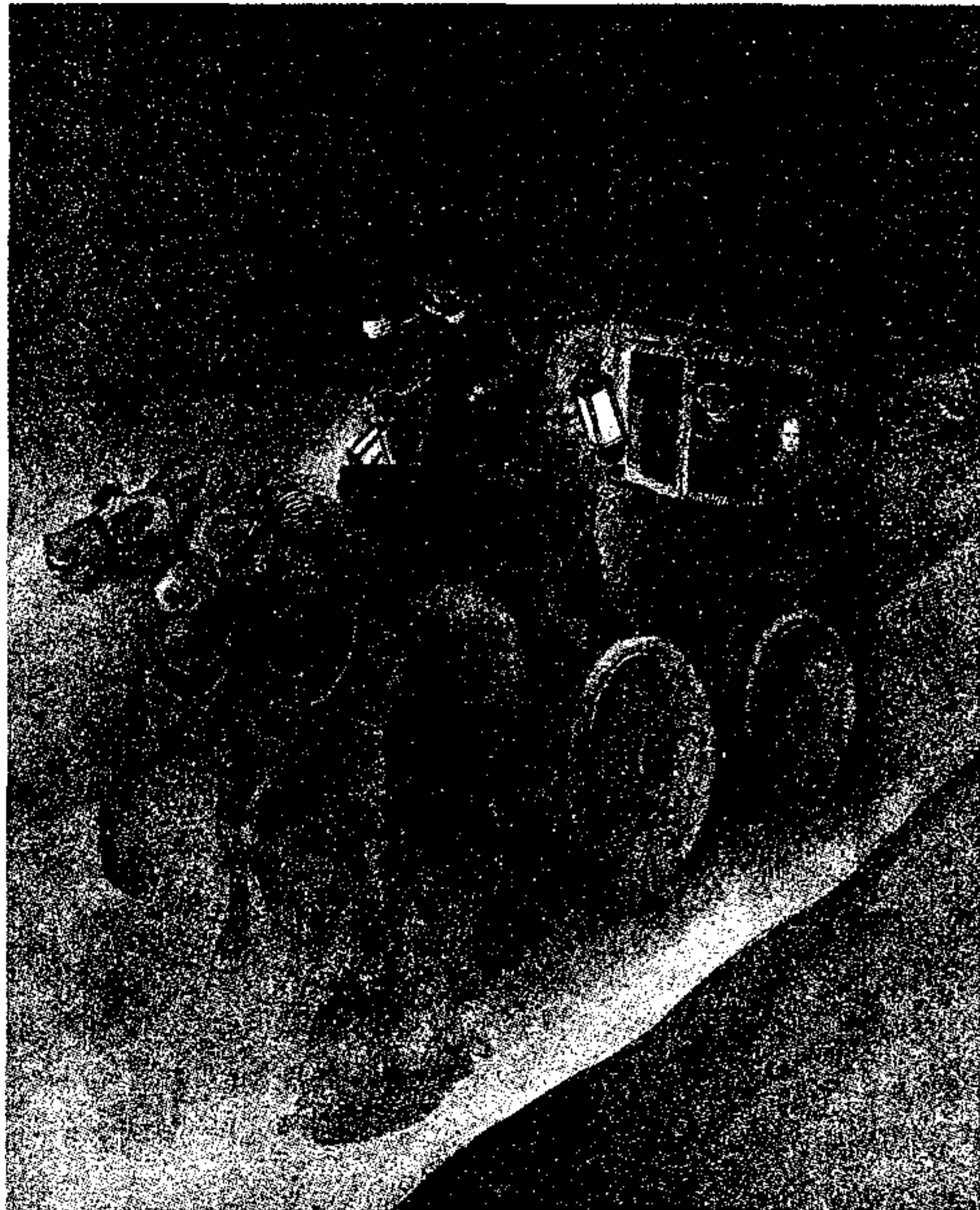
'It's the sound the wind makes, blowing across the moor.'

'No, that's the moor. It's the sound the wind makes, blowing across the moor.'