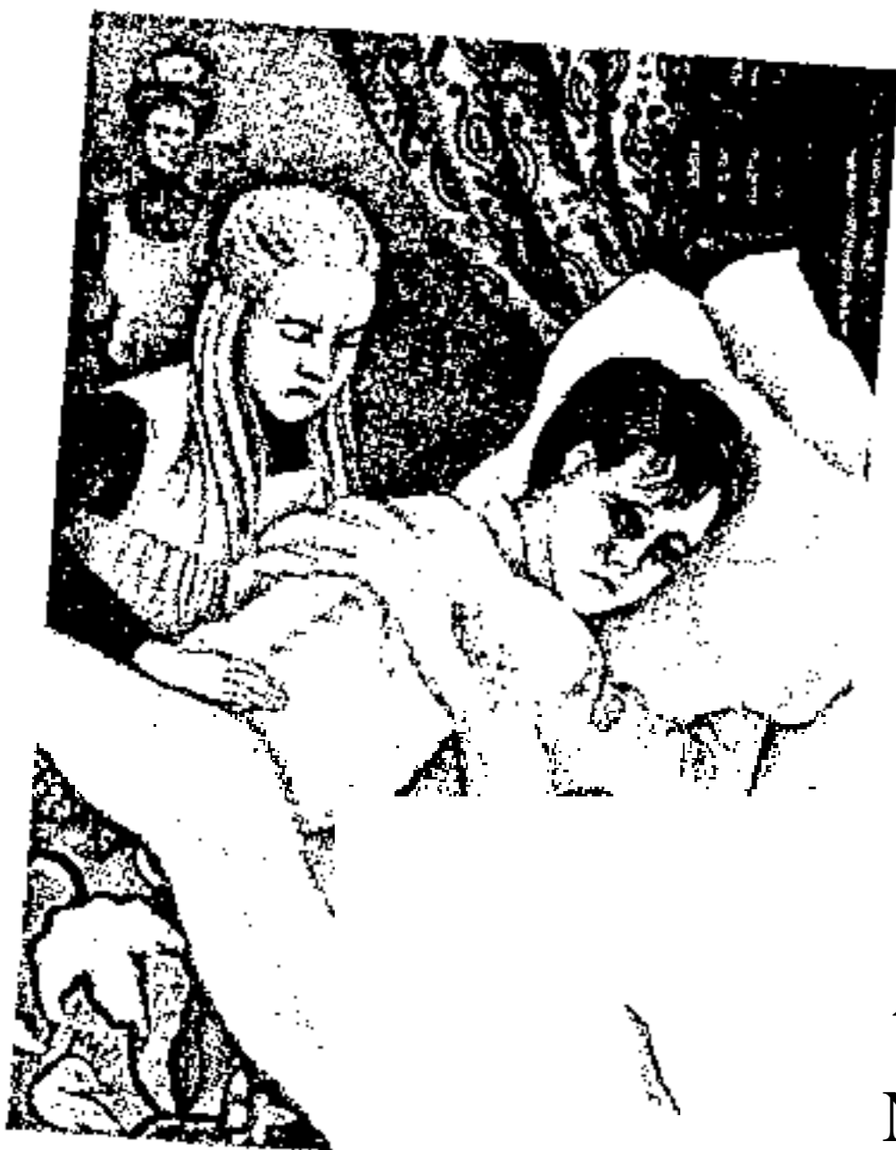
'There's nothing wrong with your back!' Mary said at last.

'There's nothing wrong with your back!' she said at last. 'Nothing at all! It's as straight as mine!'