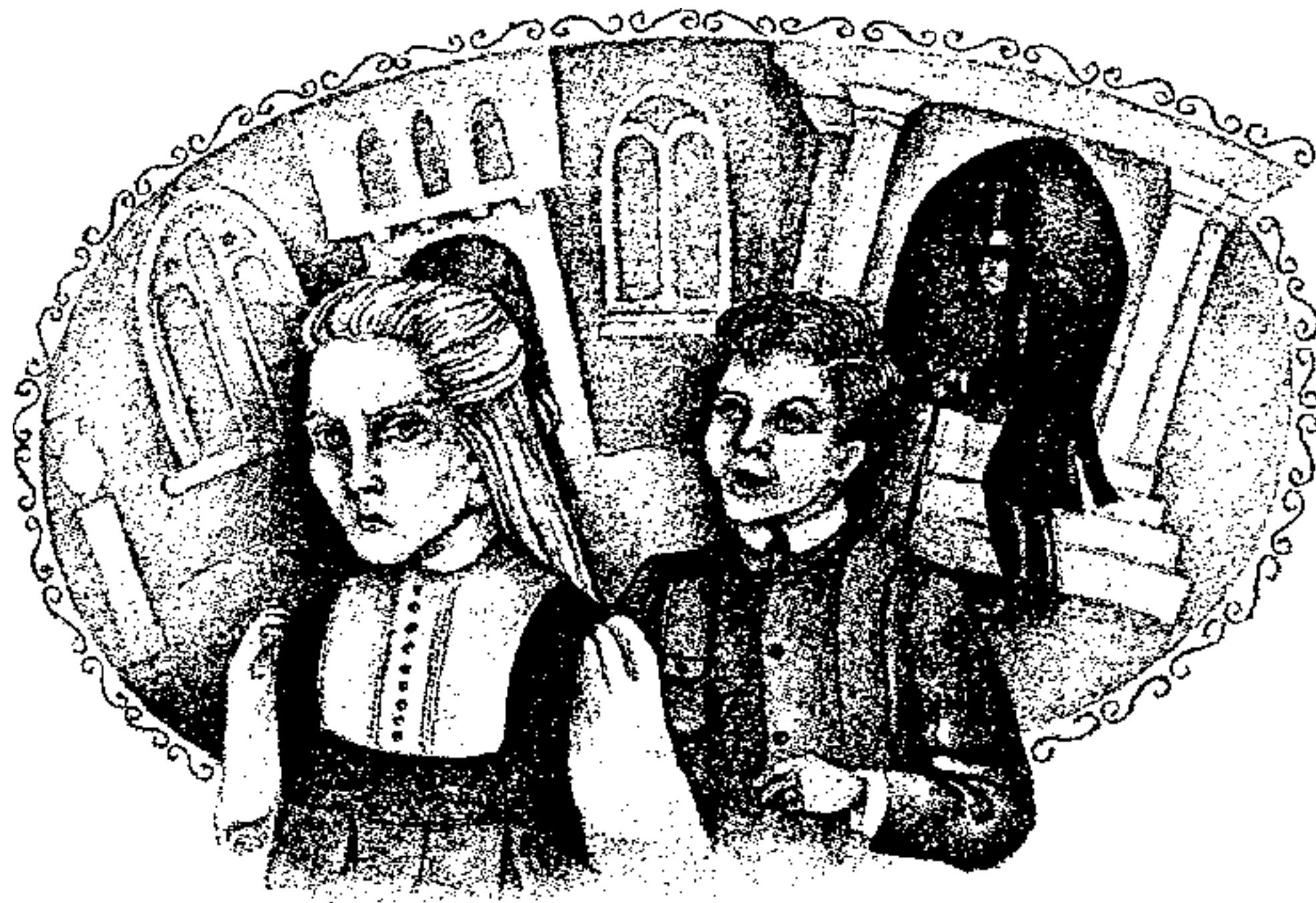
'He's got a crooked back, and he's horrid!'

'I don't believe you!' cried Mary. But the next day Basil's parents explained that she was going to live with her uncle in Yorkshire, in the north of England. Mary looked bored and cross and said nothing.