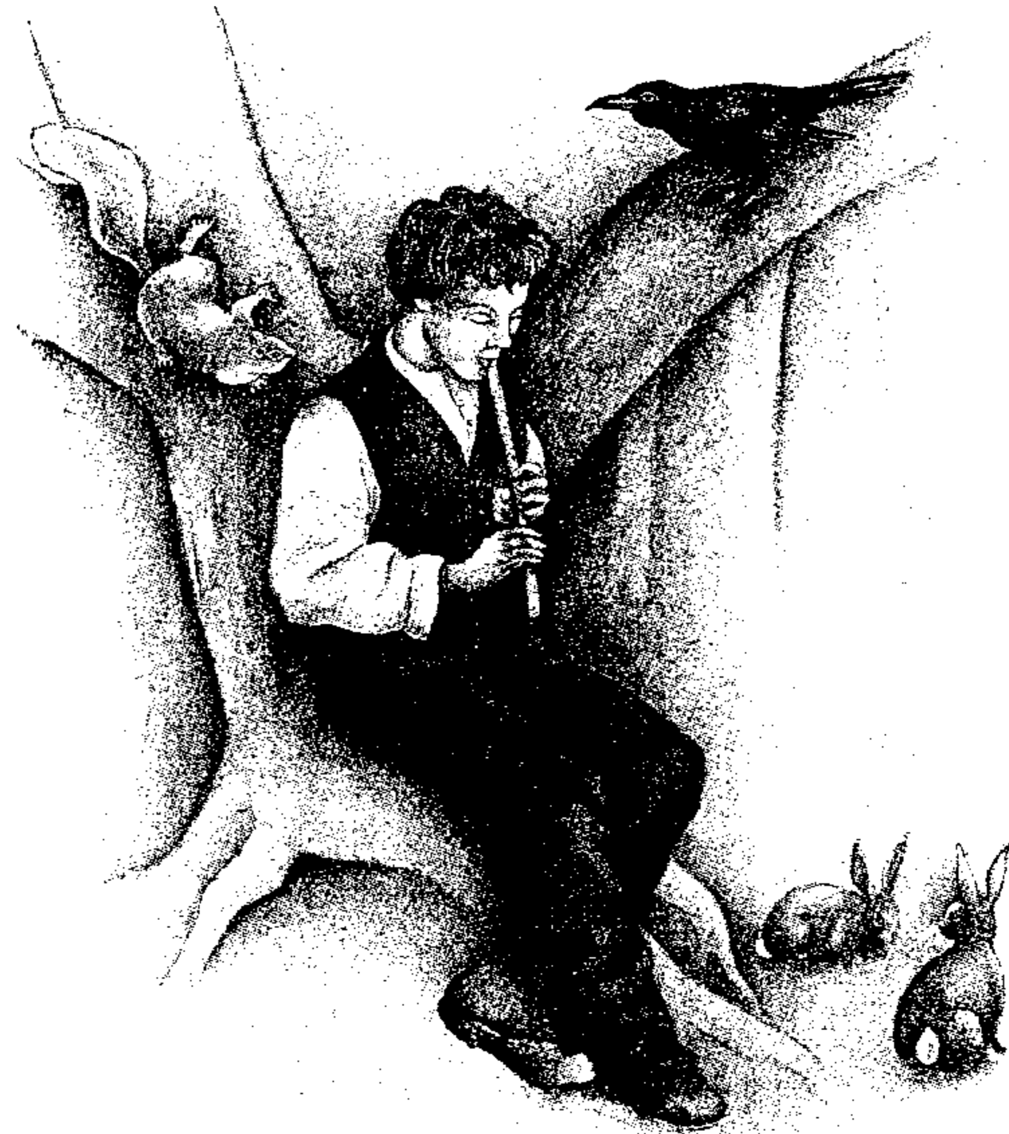
There was a squirrel and a crow in the tree, and two rabbits sitting on the grass near him.

gardens. Suddenly she heard a strange noise, and there in front of her was a boy. He was sitting under a tree, playing on a wooden pipe. He was about twelve, with a healthy red face and bright blue eyes. There was a squirrel and a crow in the tree, and two rabbits sitting on the grass near him.