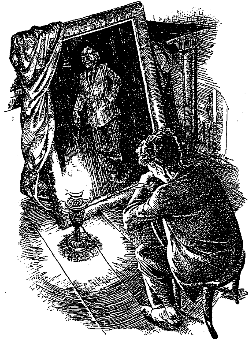
As time passed, the face in the picture grew slowly more terrible.

But behind the locked door at the top of the house, the picture of Dorian Gray grew older every year. The terrible face showed the dark secrets of his life. The heavy mouth, the yellow skin, the cruel eyes - these told the real story. Again and again, Dorian Gray went secretly to the room and looked first at the ugly and terrible face in the picture, then at the beautiful young face that laughed back at him from the mirror.