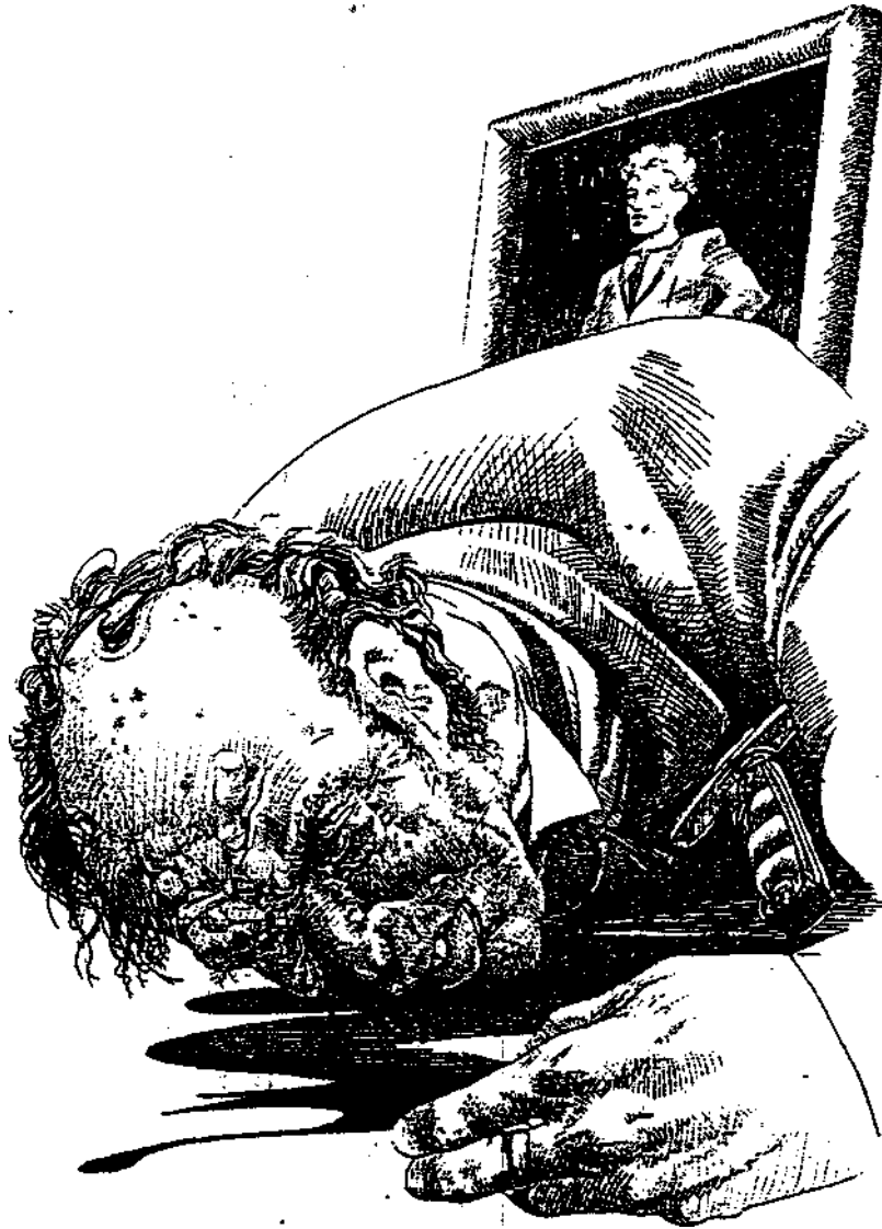
Lying on the floor was a dead man, with a knife in his heart.