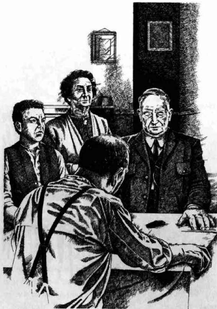
'The monkey's paw brings unhappiness with it.'

'What do I do now?' he asked his friend.