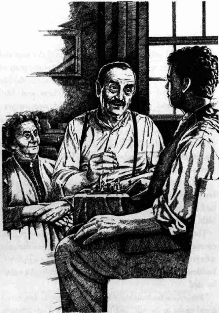
Old Mr White and his son played chess.

'Yes, that's right. He's coming at about seven o'clock,' the old man said. 'But perhaps this rain . . .'