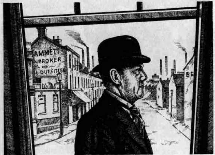
'There's a tall, well-dressed stranger in front of our house.'

'There's a man in front of our house,' Mrs White answered. 'He's a stranger – very tall – and well dressed.'