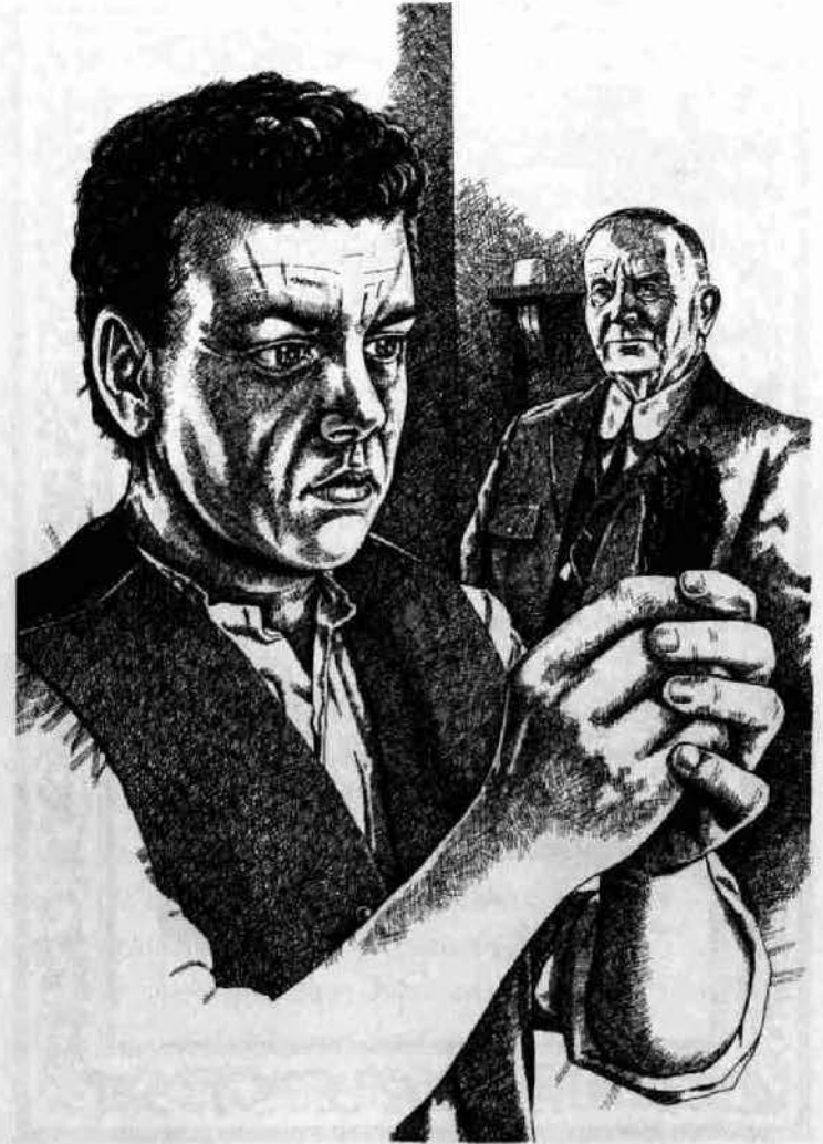
Herbert looked carefully at the monkey's paw.

Herbert laughed again, but the soldier said, 'Don't laugh, boy. Remember, you're young. I'm old now and