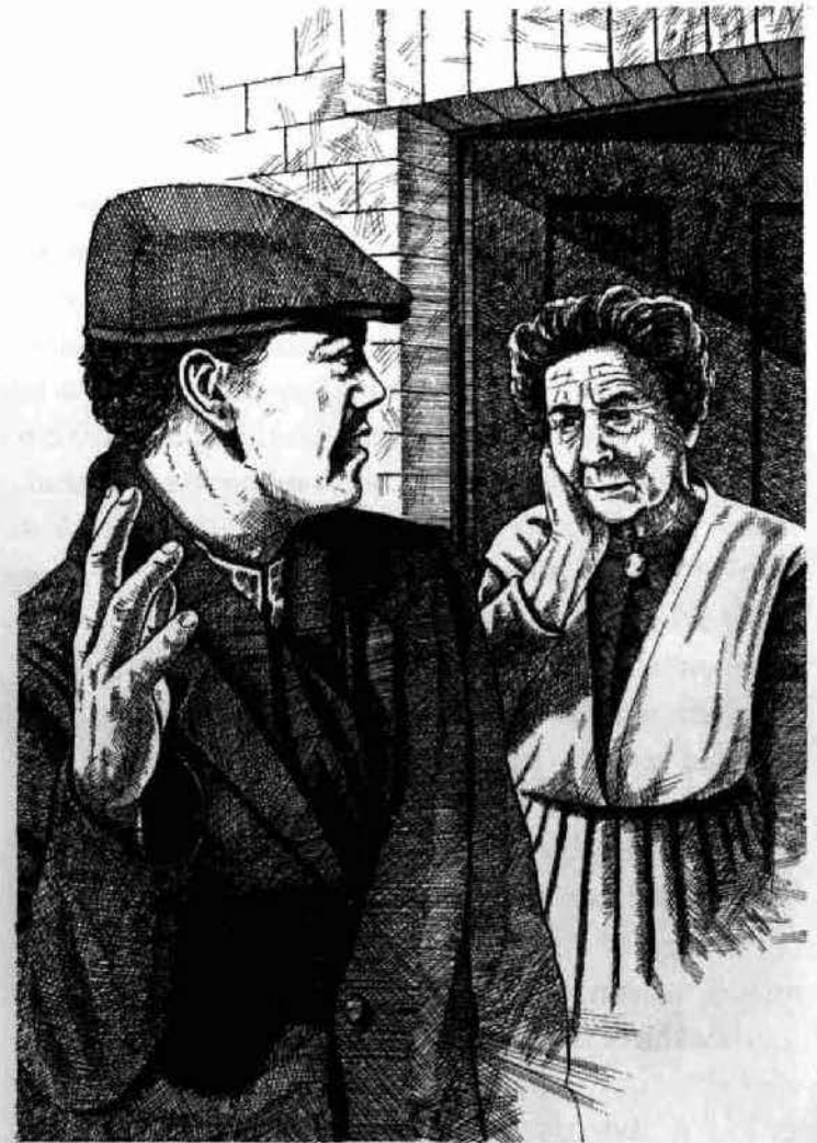
Mrs White stood at the door for some time.

Herbert left the house and walked quickly down the road. His mother stood at the door for some time and watched him. The winter sun was warm, but suddenly she felt very cold.