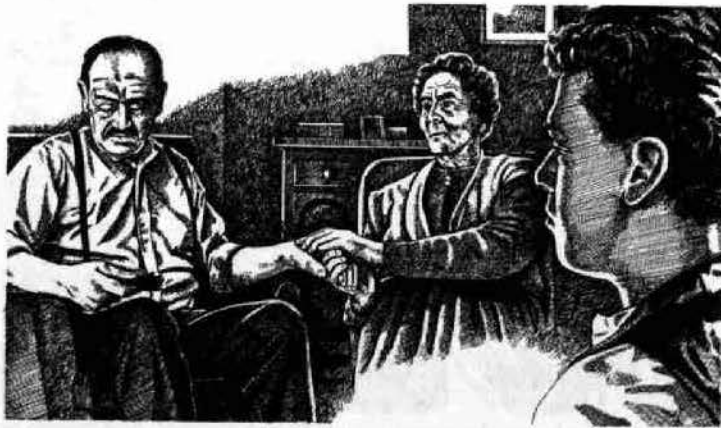
'I wish for £30,000.'

Herbert stopped talking and his old father thought for a minute. The room was quiet and they could hear the rain on the windows.