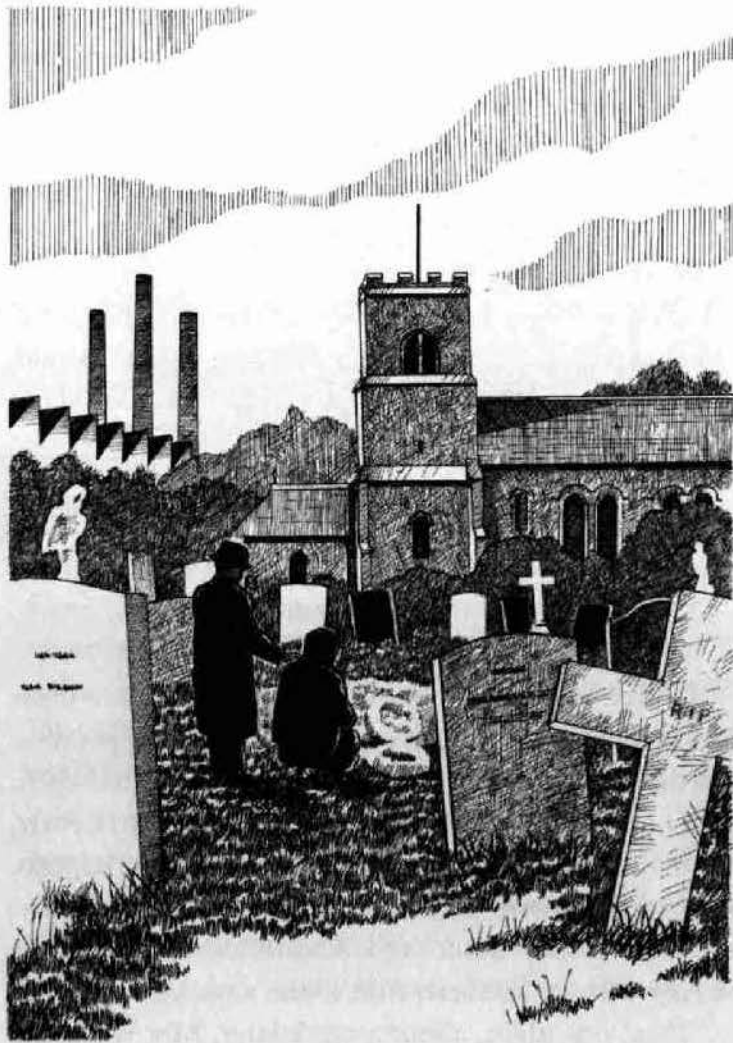
The two old people said goodbye to their dead son.

window and she watched and waited for her son. He did not come and she began to cry quietly.