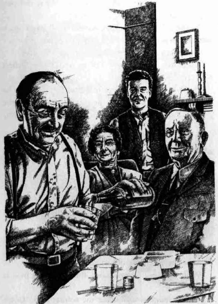
'Let's have some whisky,' old Mr White said.

Old Mr White did not stop. 'But your stories were