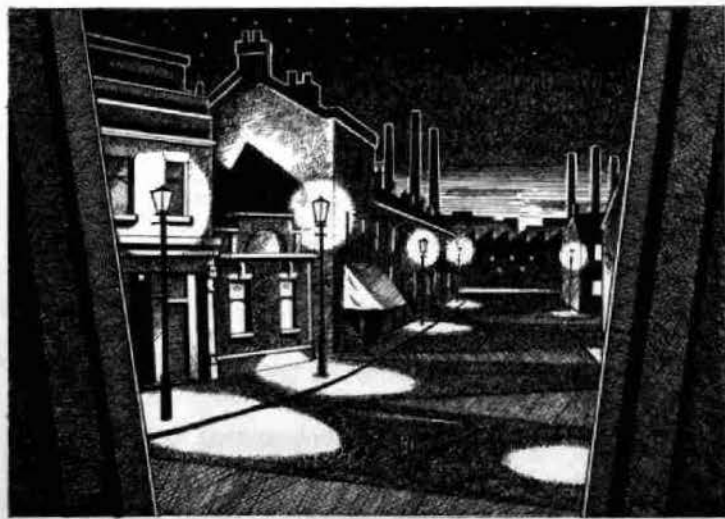
The road was dark and quiet.

At the same time Mr White took the monkey's paw