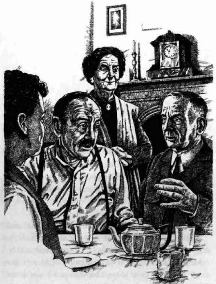
The soldier told the family many stories about India.

Then the old soldier put on his coat. He said goodbye to the White family, and went out into the rain.