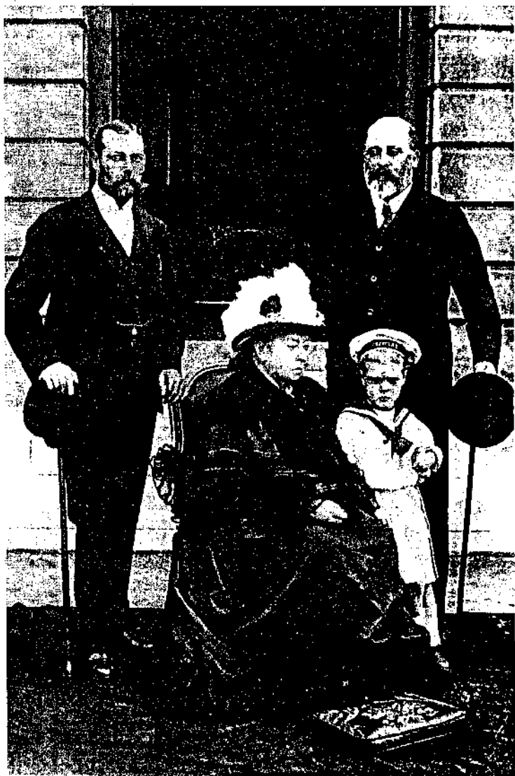
Queen Victoria and three future Kings: George V (left), Edward VII (right), and Edward VIII (in sailor suit)