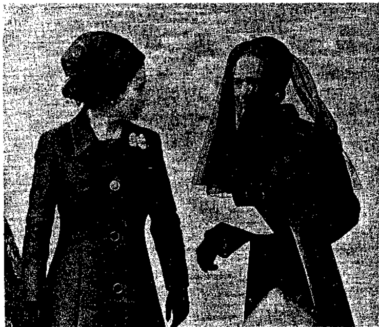
The Duchess with Queen Elizabeth II at Buckingham Palace after Edward's death.