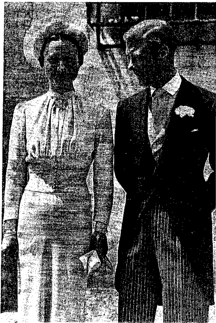
Edward married Wallis Simpson on 3rd June 1937.