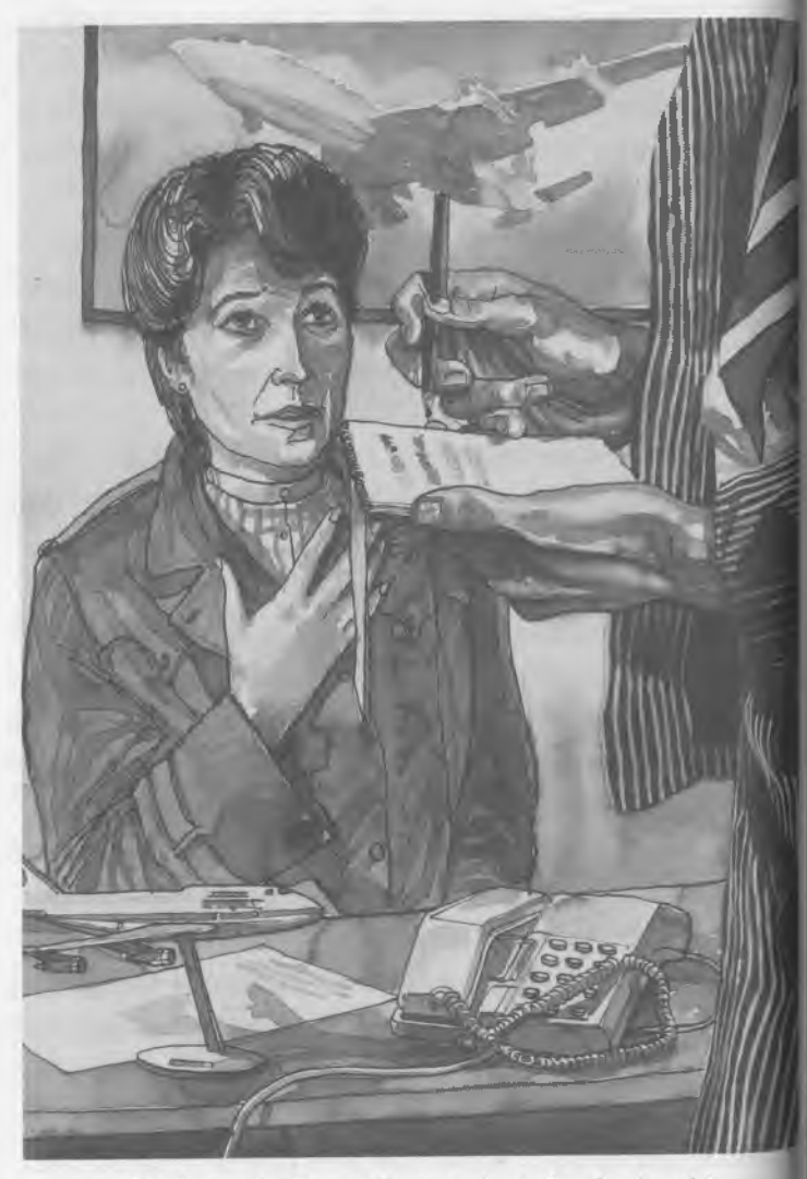
'We hope the Prime Minister loves her husband.'