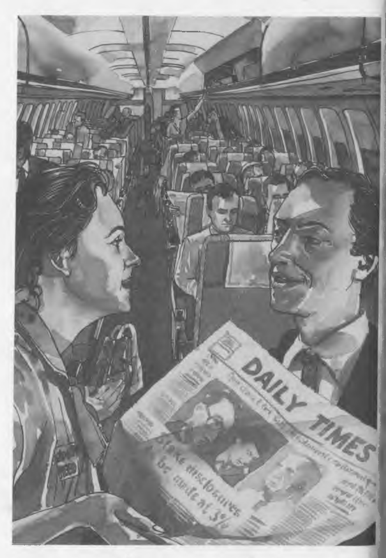
'Welcome aboard, sir.'