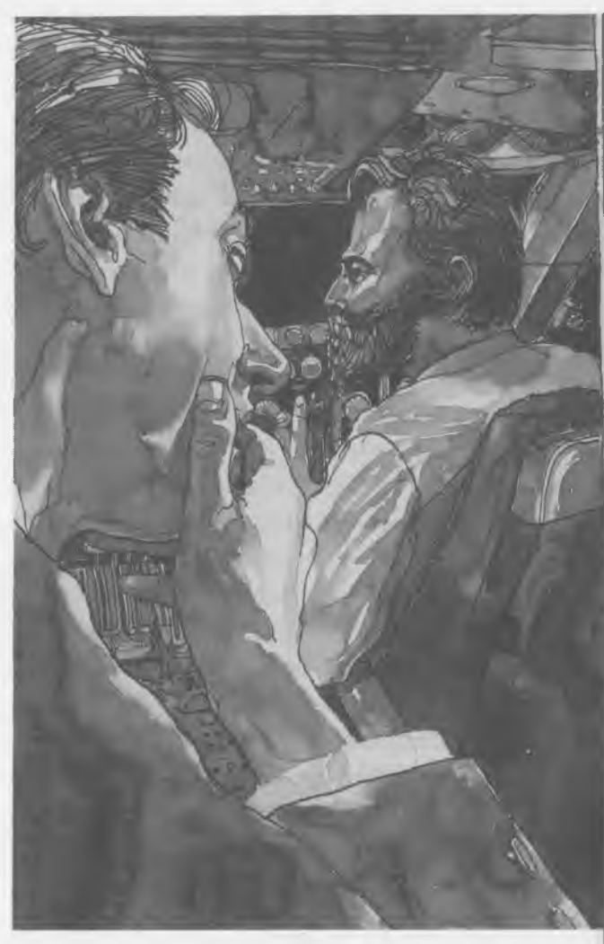
Carl could see the bearded hijacker from the light of instruments.