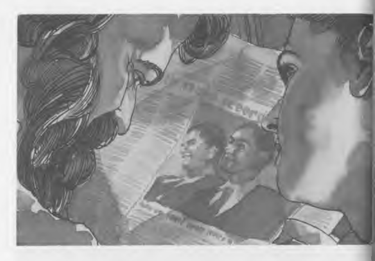
The hijacker looked at the photo, and then at Carl.