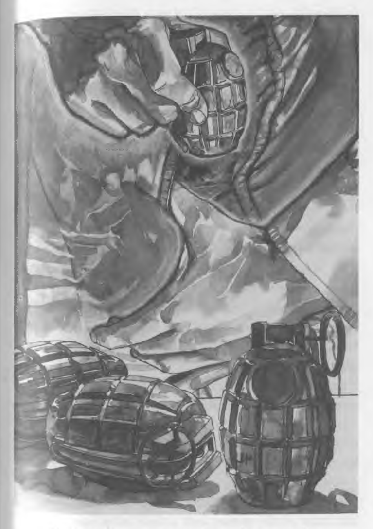
The Colonel put some grenades in the coat pocket.