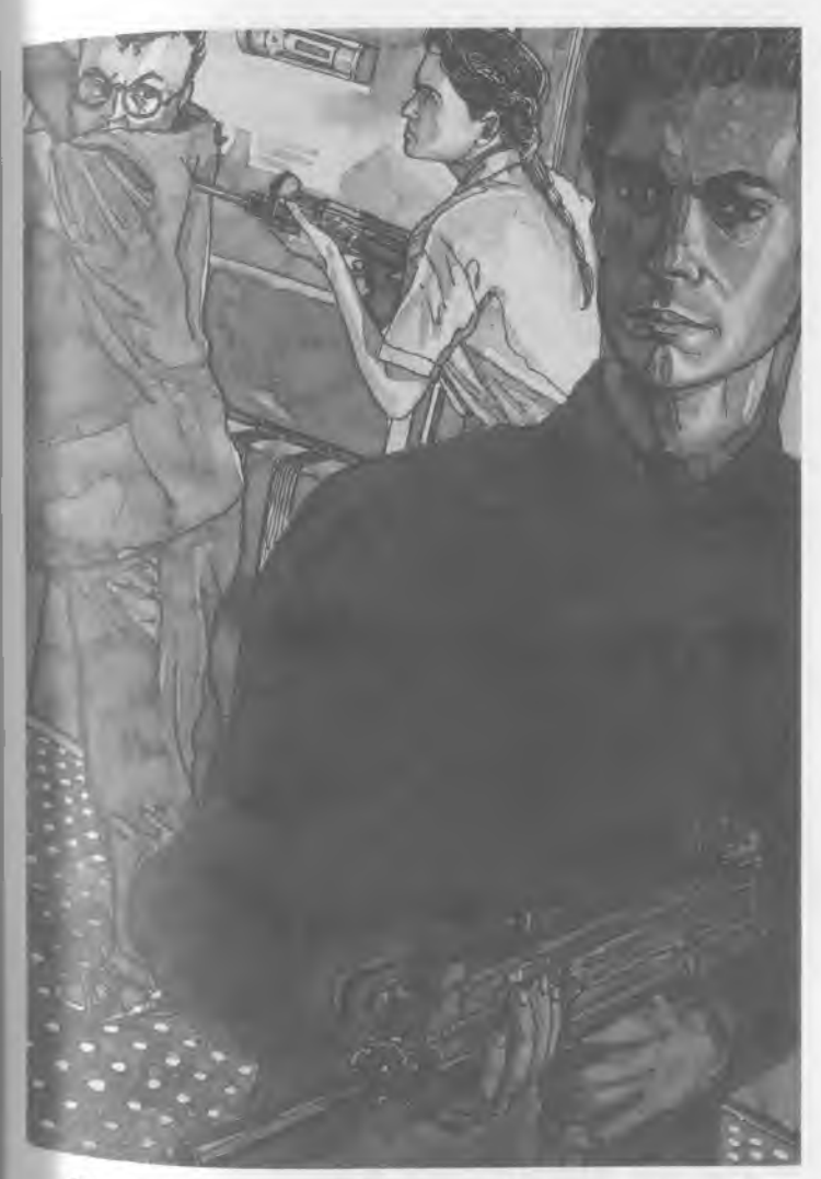
The air hostess pointed her gun at the American's back.