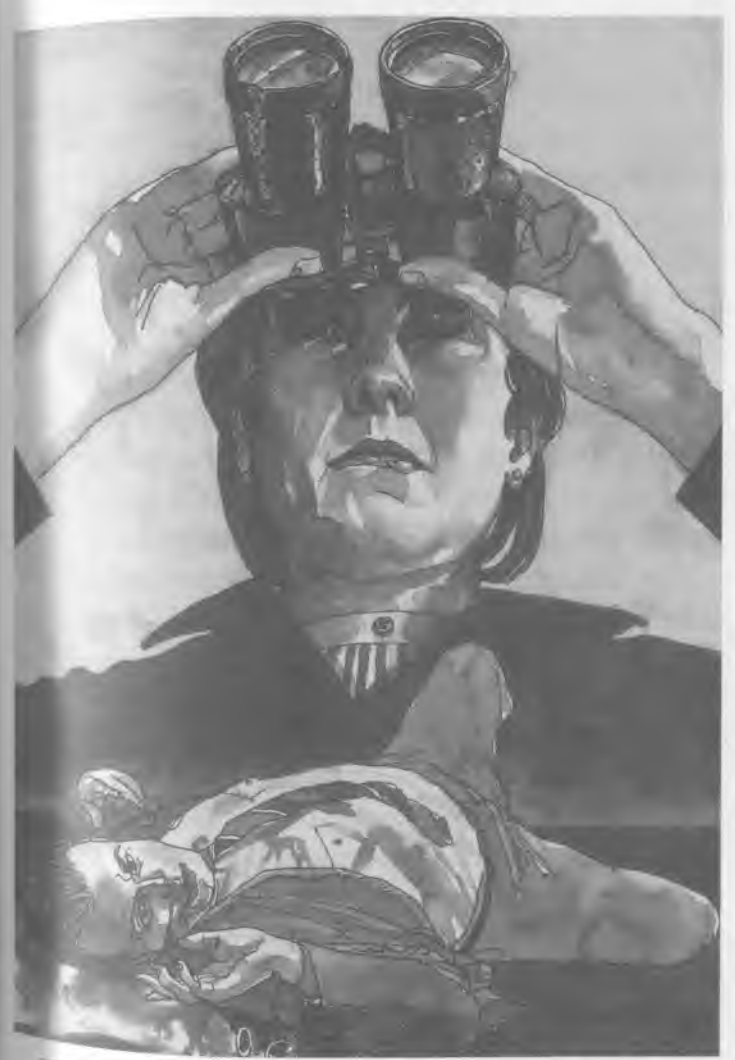
There was a pool of blood on the tarmac, around his head.