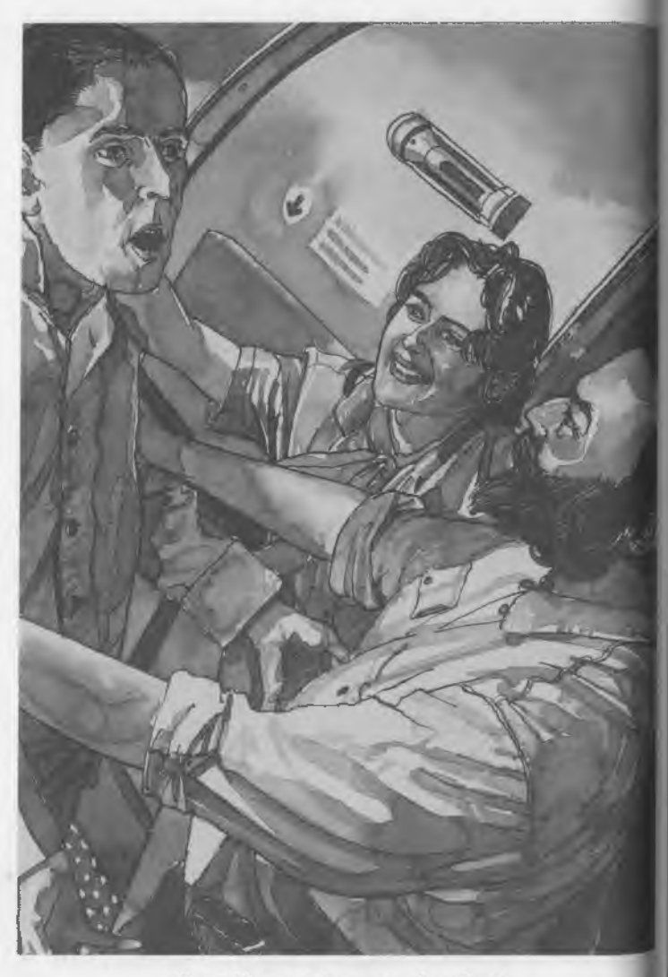
'Free! You are free now, brother!'