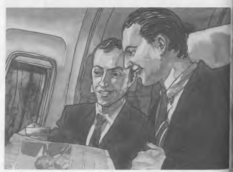
'I'm just a police officer.'

Harald laughed. 'You're the famous man, sir, not me,'