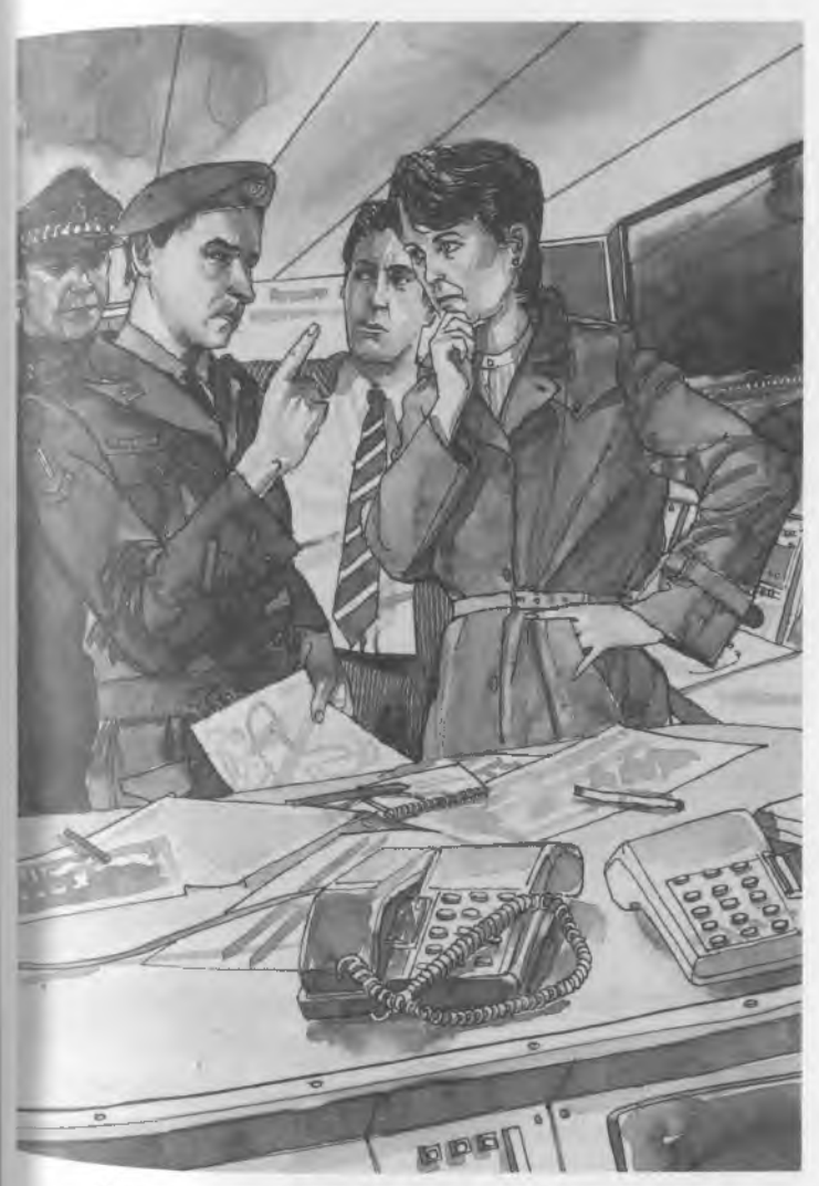
'Just one hour. Then they'll kill the first passenger.'