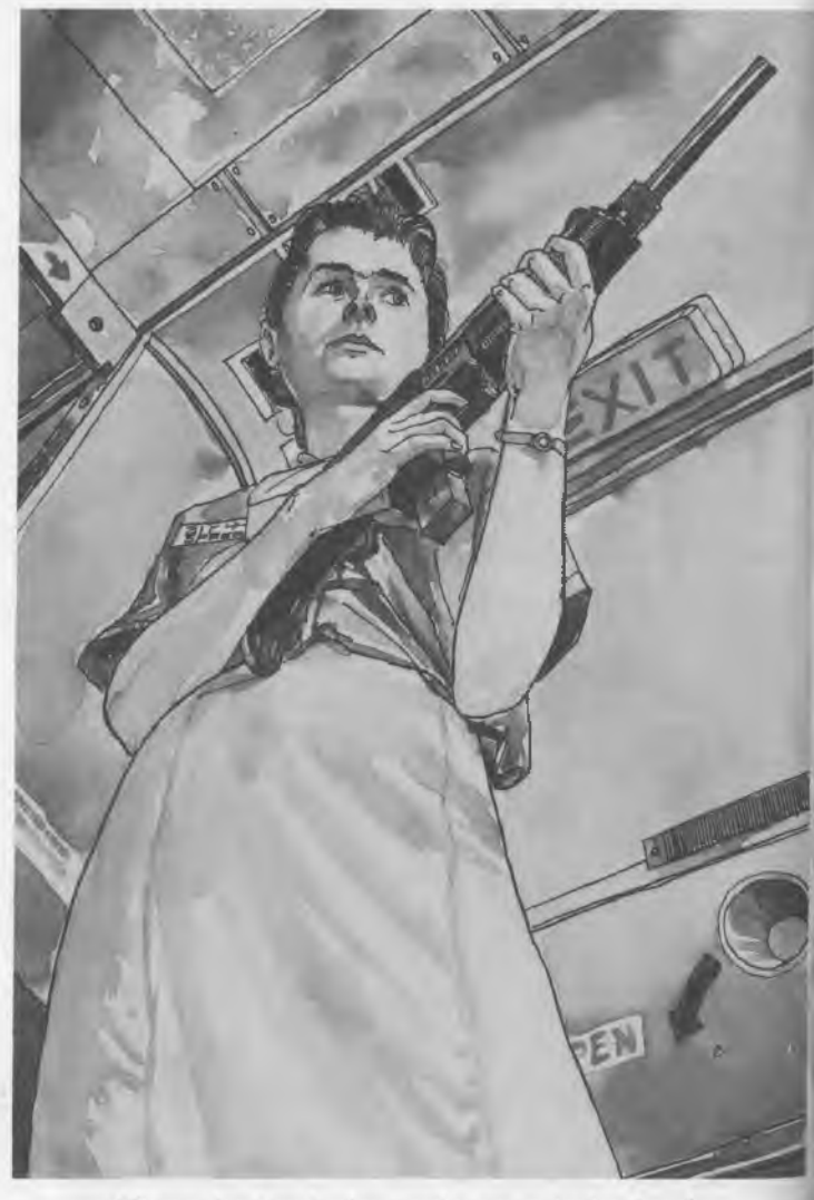
The air hostess had a machine gun in her hand.