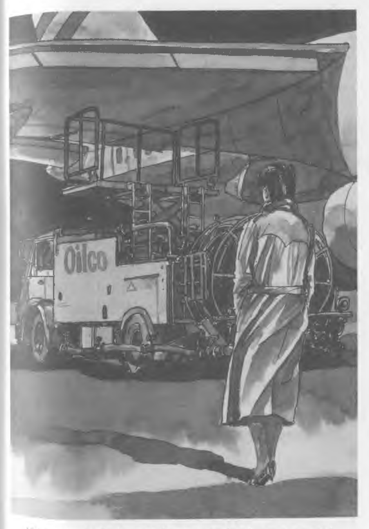
I'm going to find out. I don't care what happens to me.'