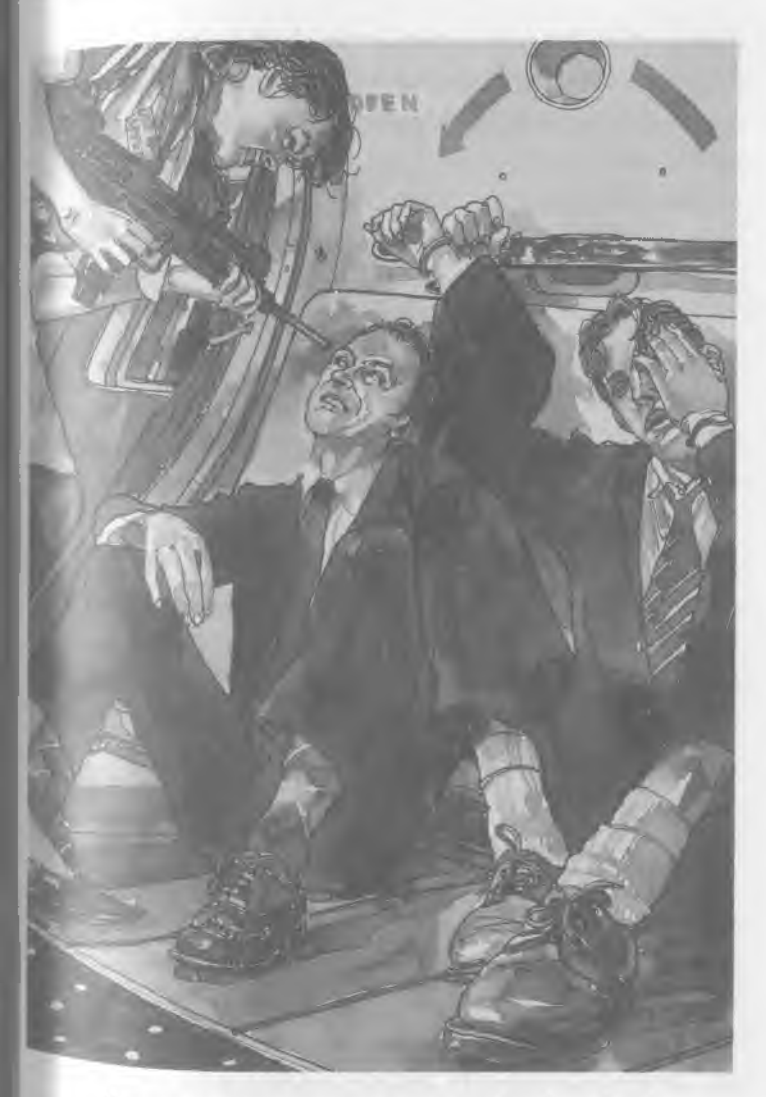
'I want your government to set our brothers free.'