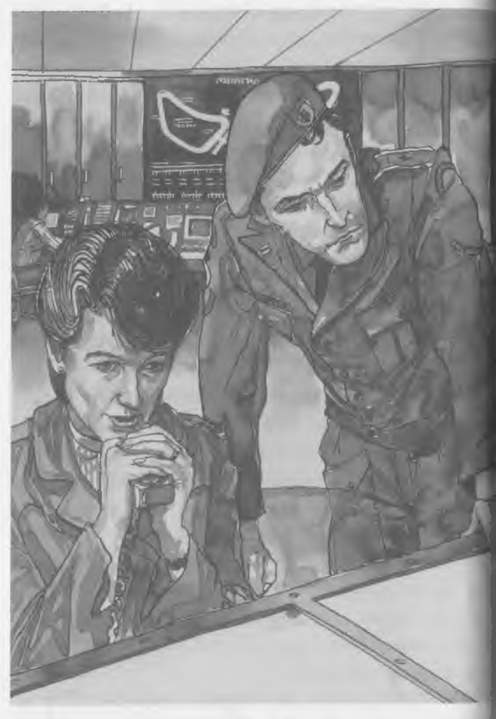
'If my brothers are not here in four minutes, your husband will die.'