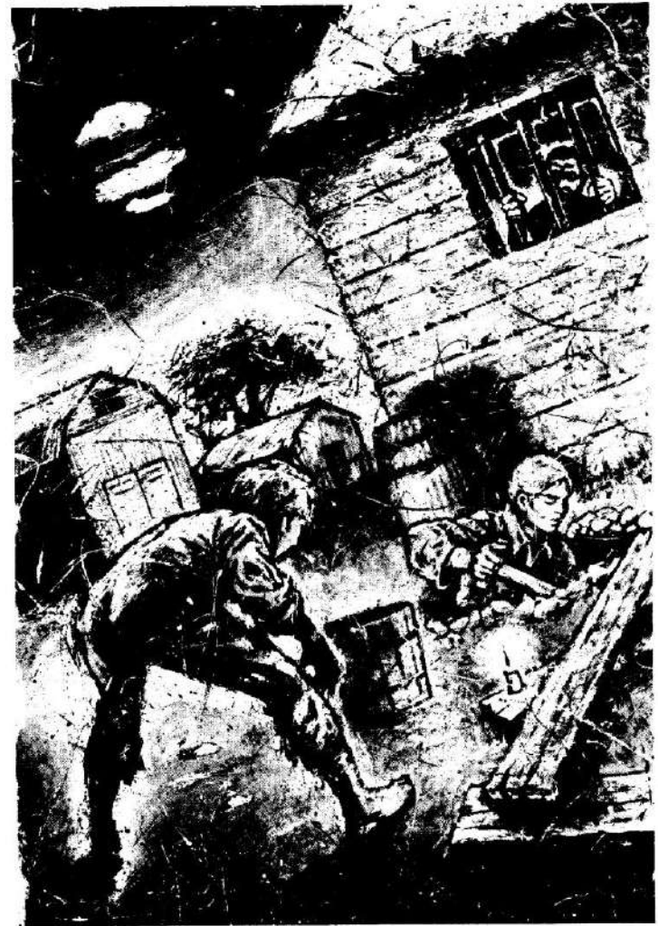
We dug a hole right under the wall of the hut.

We also wrote secret letters to everybody. Tom said that