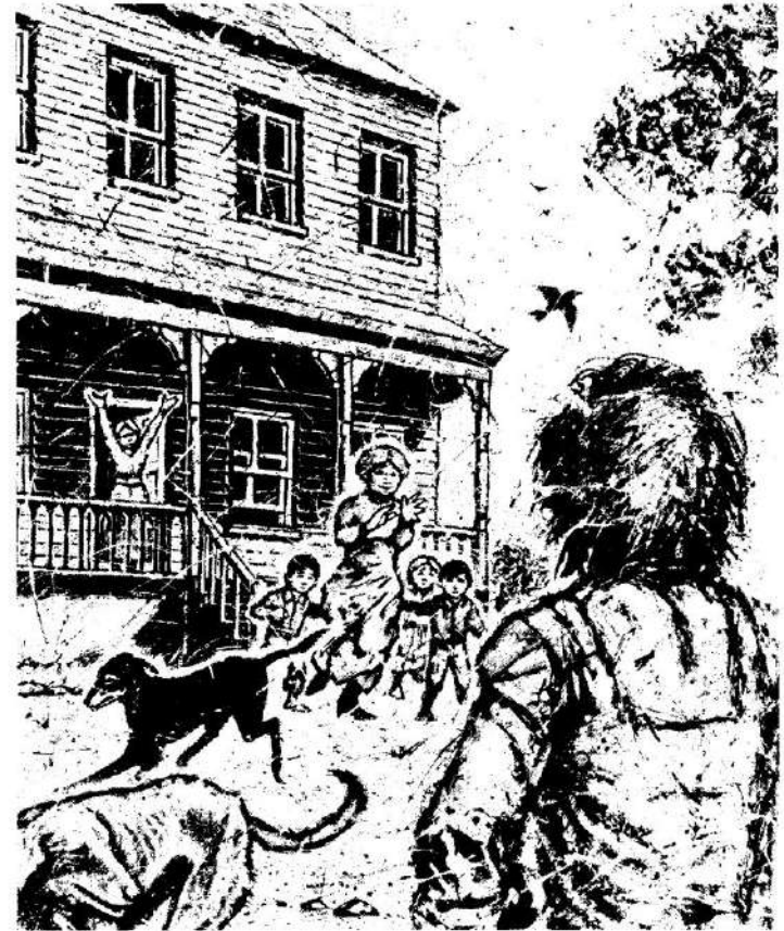
She was smiling all over her face.

I didn't stop to think. 'Yes, ma'am,' I said.