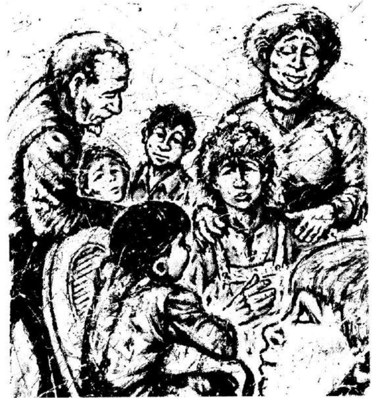
We all sat there talking and I could answer all their questions.

We all sat there talking and I could answer all their questions about the Sawyer family. I was feeling really