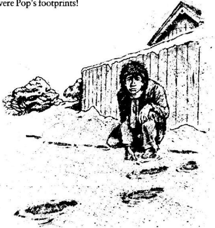
They were Pop's footprints!

Then, one morning, there was some new snow on the ground and outside the back garden I could see footprints in the snow. I went out to look at them more carefully. They were Pop's footprints!