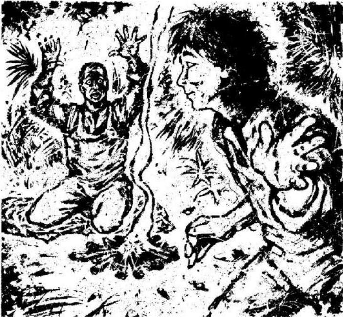
Jim fell to his knees. 'Please don't hurt me!' he cried.

Jim fell to his knees. 'Please don't hurt me!' he cried. 'I've always been good to dead people!'