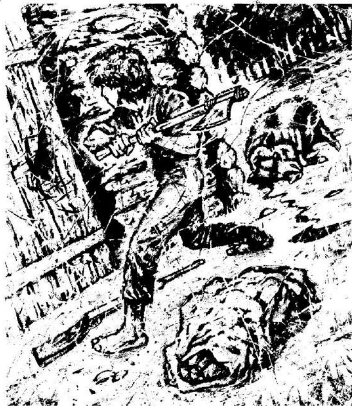
I broke down the door with an axe.

went into the woods. There I shot a wild pig and took it back to the hut with me. Next, I broke down the door with an axe. I carried the pig into the hut and put some of its blood on the ground. Then I put some big stones in a sack and pulled it along behind me to the river. Last of all, I put some