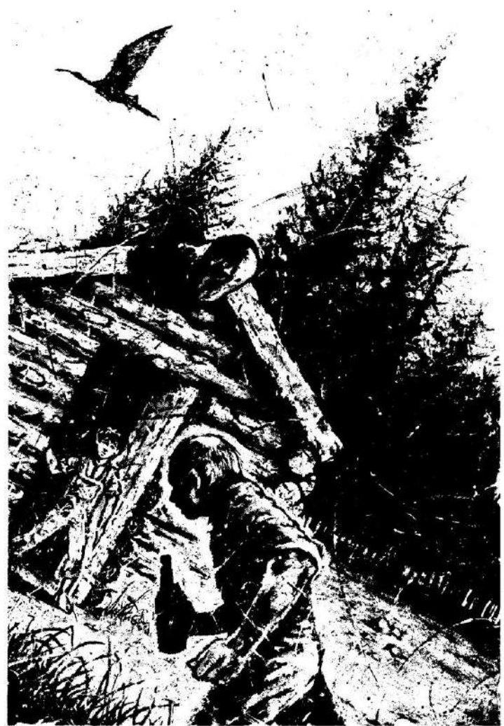
I had to stay with him in a hut in the woods.

The next day he was drunk, and he went to Judge Thatcher to get my money. The judge wouldn't give it to him. But Pop didn't stop trying and every few days I got two or three dollars from the judge to stop Pop from hitting me. But when Pop had money, he got drunk again and made trouble in town. He was always coming to the widow's house, and she got angry and told him to stay away. Then Pop got really angry and one day he caught me and took me a long way up the river in a boat. I had to stay with him in a hut in the woods and I couldn't go out by myself. He watched me all the time. The widow sent a man to find me and bring me home, but Pop went after him with a gun, and the man ran away.