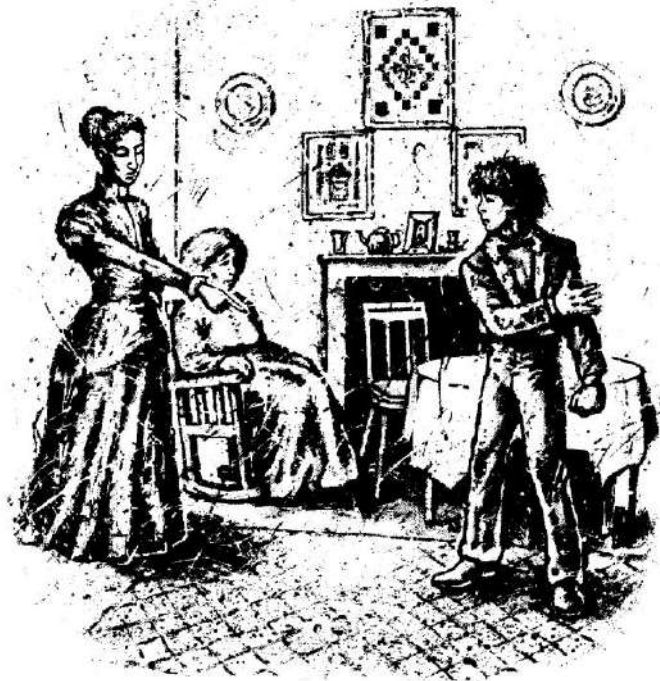
Miss Watson was angry, but the widow just looked unhappy.

Time went on and winter came. I went to school most of the time and I was learning to read and write a little. It wasn't too bad, and the widow was pleased with me. Miss Watson had a slave, an old man called Jim, and he and I were good friends. I often sat talking to Jim, but I still didn't like living in a house and sleeping in a bed.