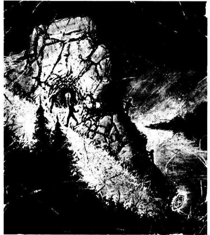
Tom's secret place was a cave, deep in the side of a hill.

'Now, we'll have this gang of robbers,' he said, 'and we'll call it Tom Sawyer's Gang. If somebody hurts one of us, the others will kill him and his family. And if a boy from the