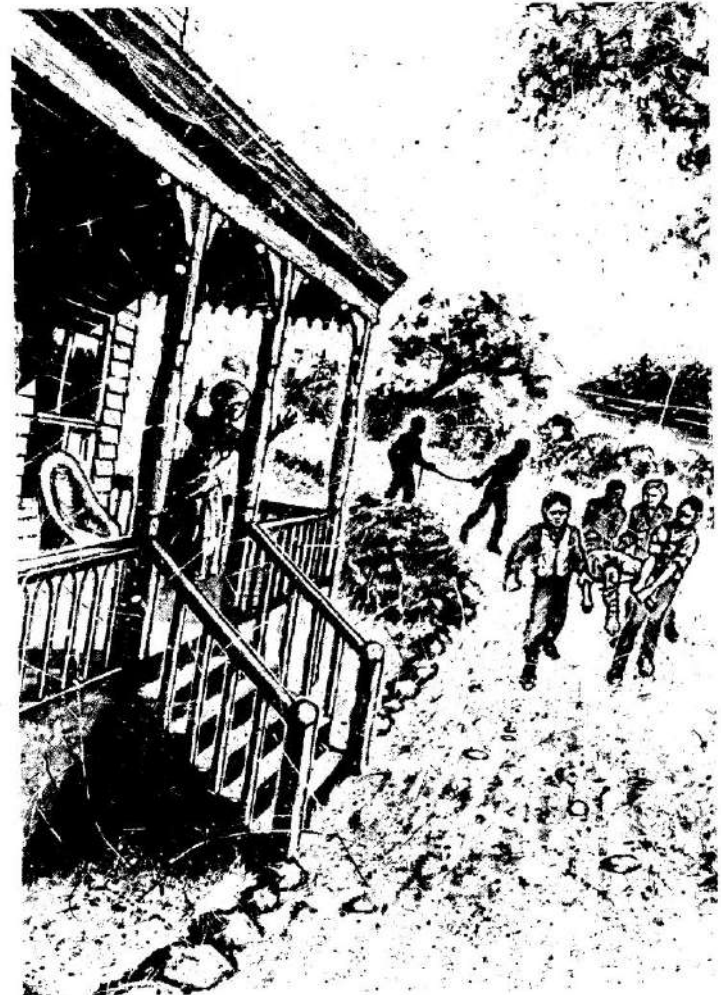
They carried Tom home to the Phelps' house – and they brought Jim too.

When Tom woke up the next day, he felt better. I was in the room and he said to me, 'Jim's all right, isn't he?'