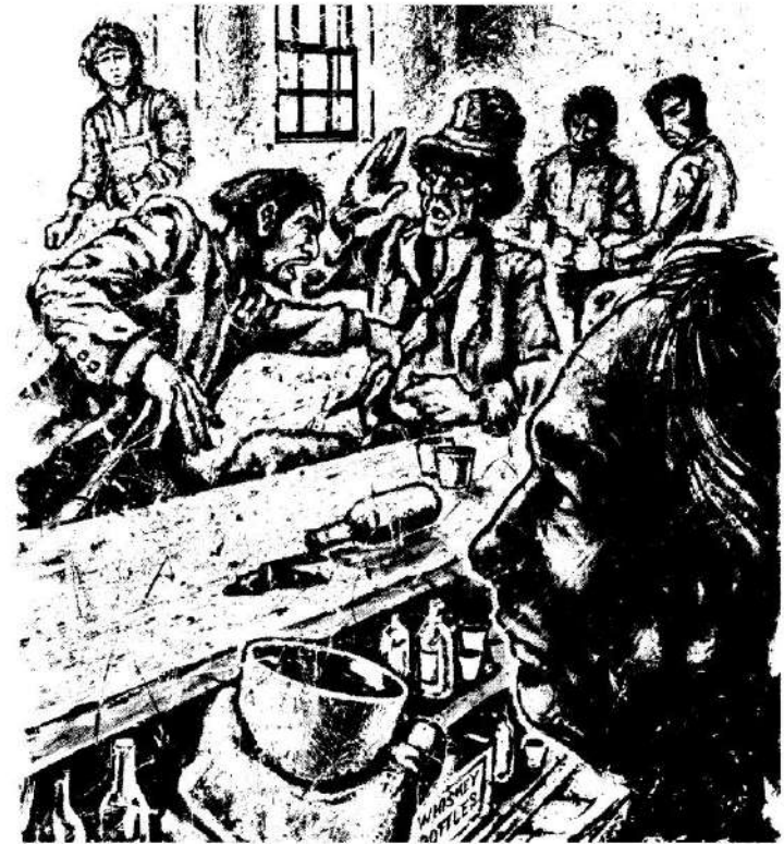
We found the King in a bar, drunk.

'Now we can get away from them,' I thought. I turned