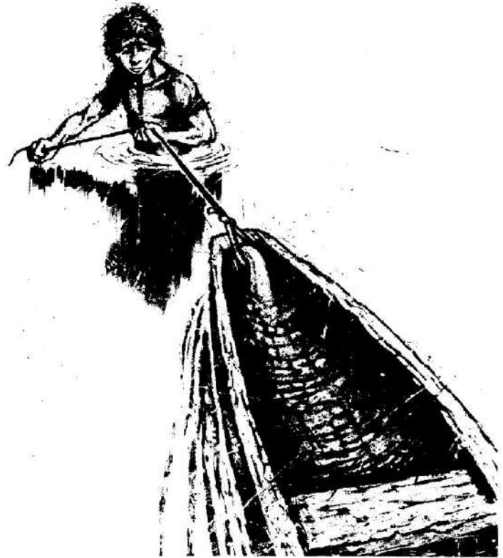
I jumped into the river and brought the canoe to the side.

That afternoon, Pop locked me in and went off to town.