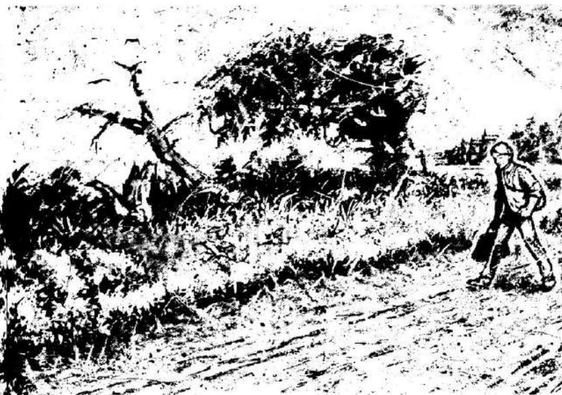
Before I was halfway to town, there was Tom Sawyer coming along.

'All right,' I said, 'but there's another thing. You know old Miss Watson's slave Jim, who ran away? Well, he's a prisoner here, and I'm going to help him escape.'