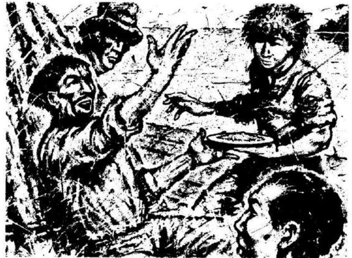
'Bring me my dinner!' said the Duke.

So we did things for him, and he liked it. But the old man