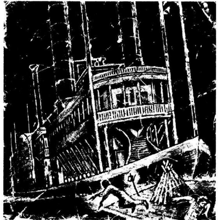
The next minute the steamboat was right over us.

Well, the people who lived in that house were very kind, and they took me in and gave me some new clothes and a