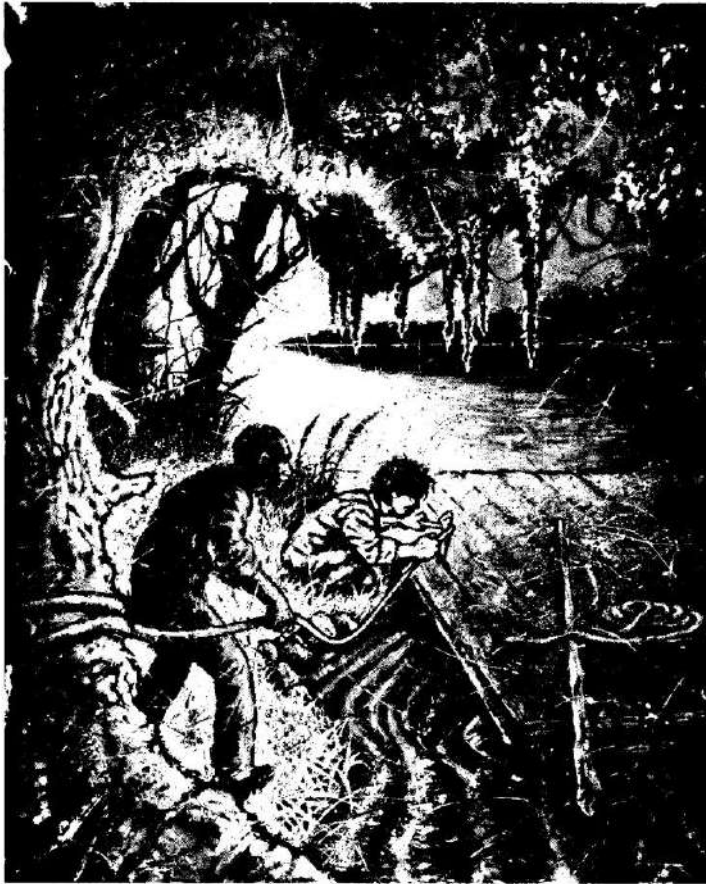
We tied the raft up under the trees.

and was about four metres by five metres. 'This could be useful,' I said to Jim, so we pulled it back to the island behind the canoe, and tied it up under the trees.