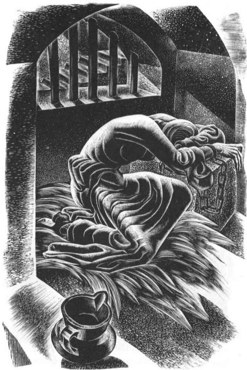
In the prison Justine waited quietly for death.