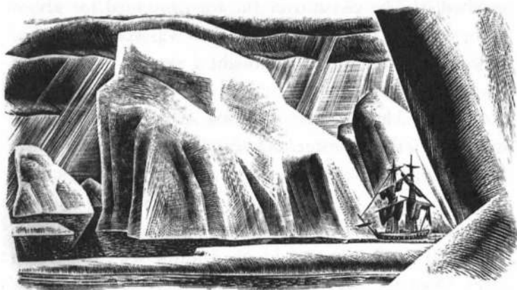
Many hours went by, and then I saw your ship.

Goodbye. This is the end of Victor Frankenstein's story.