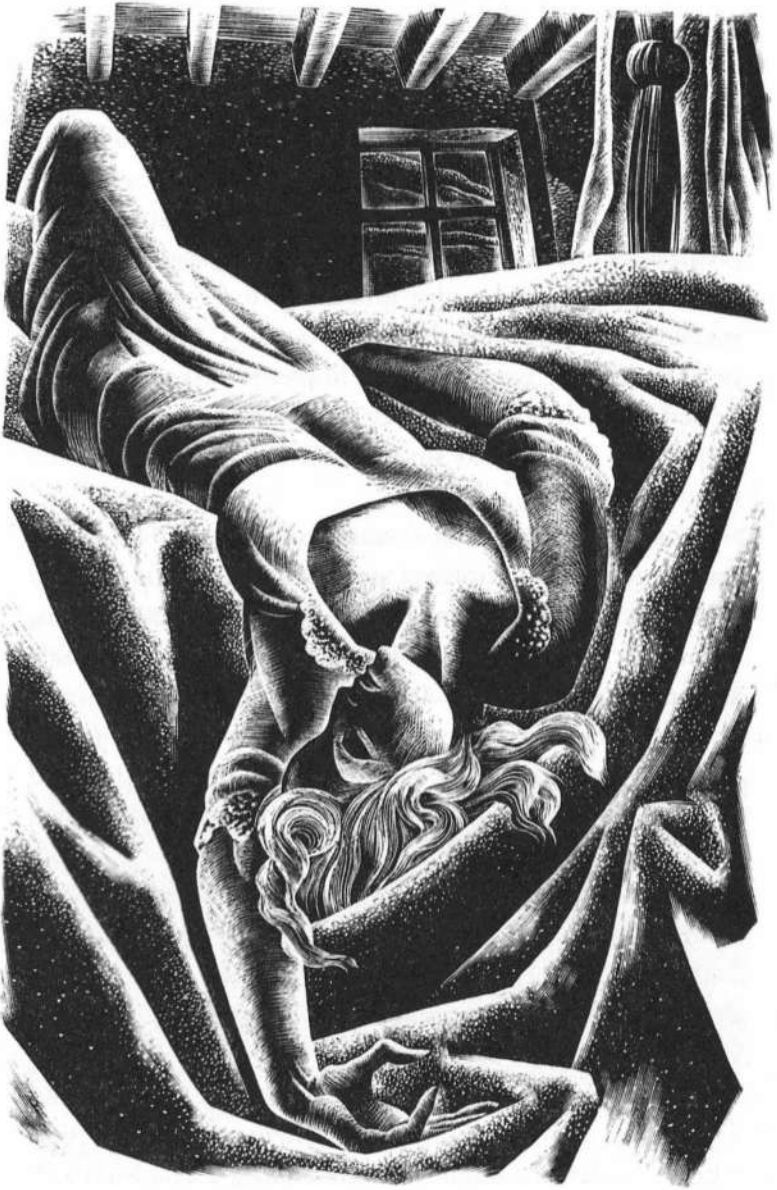
On the bed, Elizabeth lay still, in the cold sleep of death.