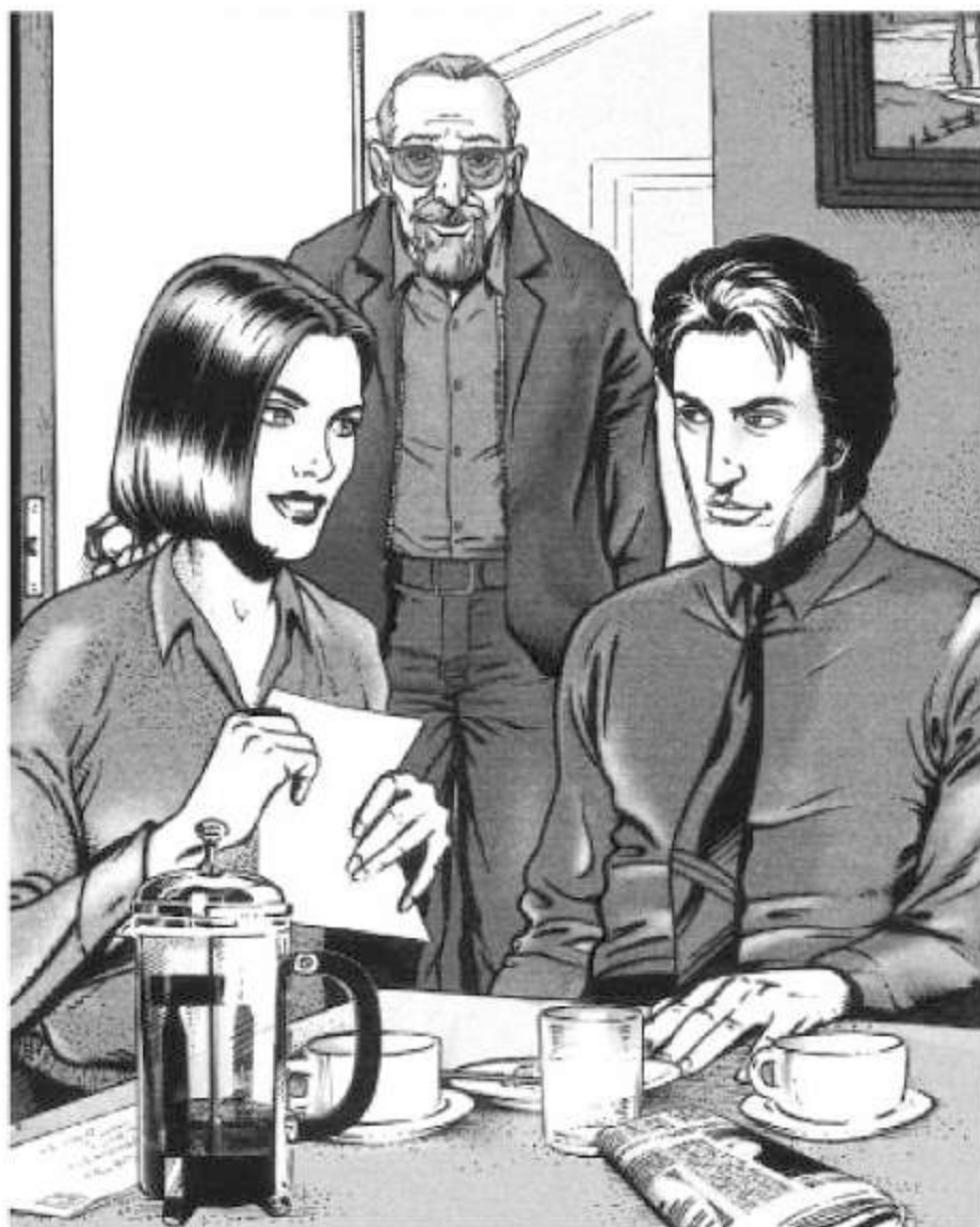
Jan's father came slowly into the room.

Josef Vlach was sixty-eight years old, and his eyes were bad. He couldn't see very well, so he lived with Carol and Jan.