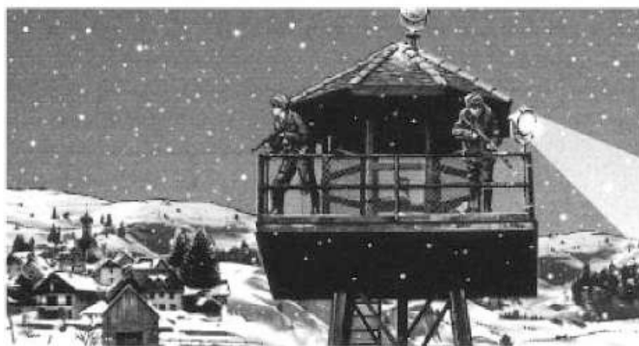
The border guards watch day and night.

In a house in the village a man and a woman are talking. The woman holds a six-month-old baby boy in her arms. She is excited, but she is afraid, too.