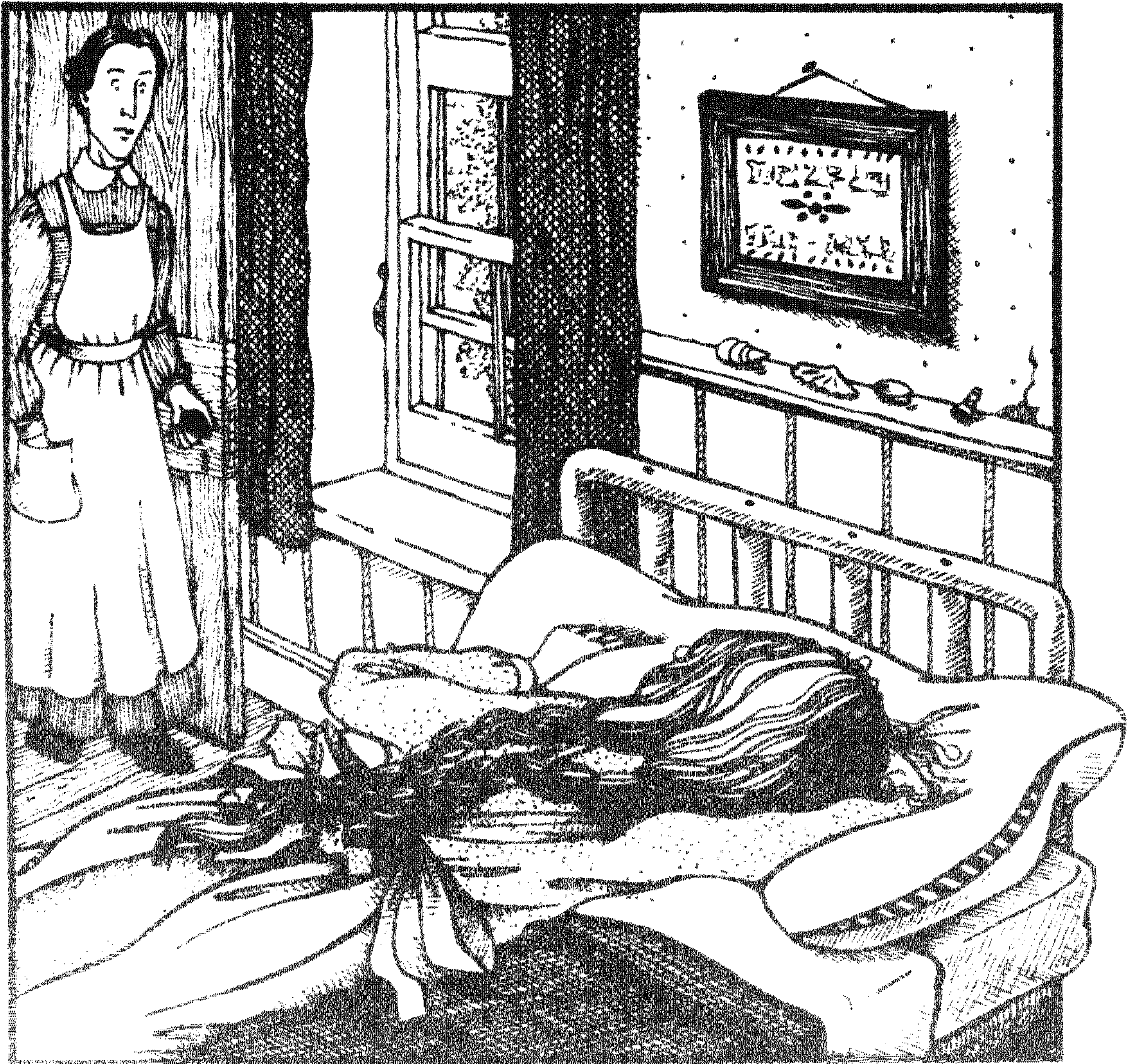
Anne was lying on her narrow bed, sobbing loudly.

'You mustn't get angry like that, Anne. Mrs Lynde is my friend, and you were very rude to her.'