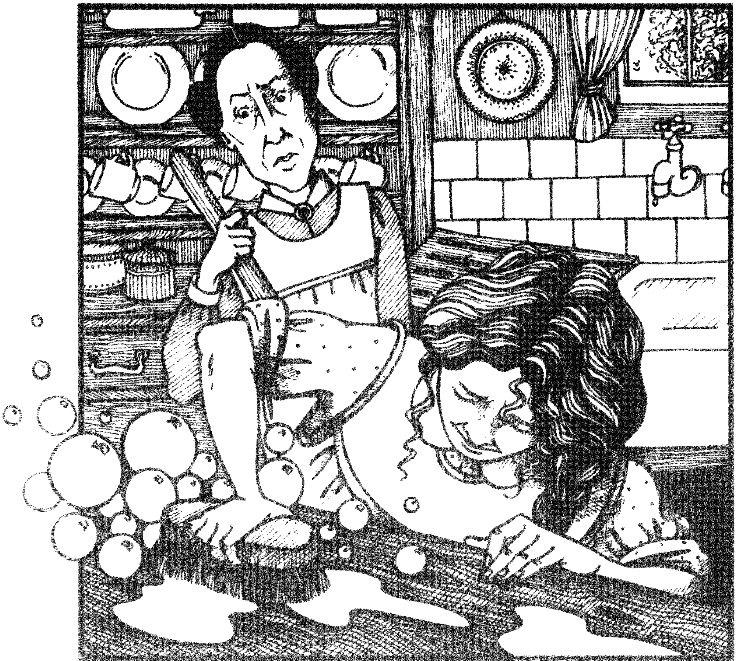
In the morning Anne helped Marilla with the housework.

When the two girls met, they knew at once that they would be good friends. They often played together, in the fields, or by the river, or in the garden. In the morning Anne helped Marilla with the housework. Then in the afternoon she played with Diana, or talked happily to Matthew while he worked on the farm. She soon knew and loved every flower, tree, and animal at Green Gables.