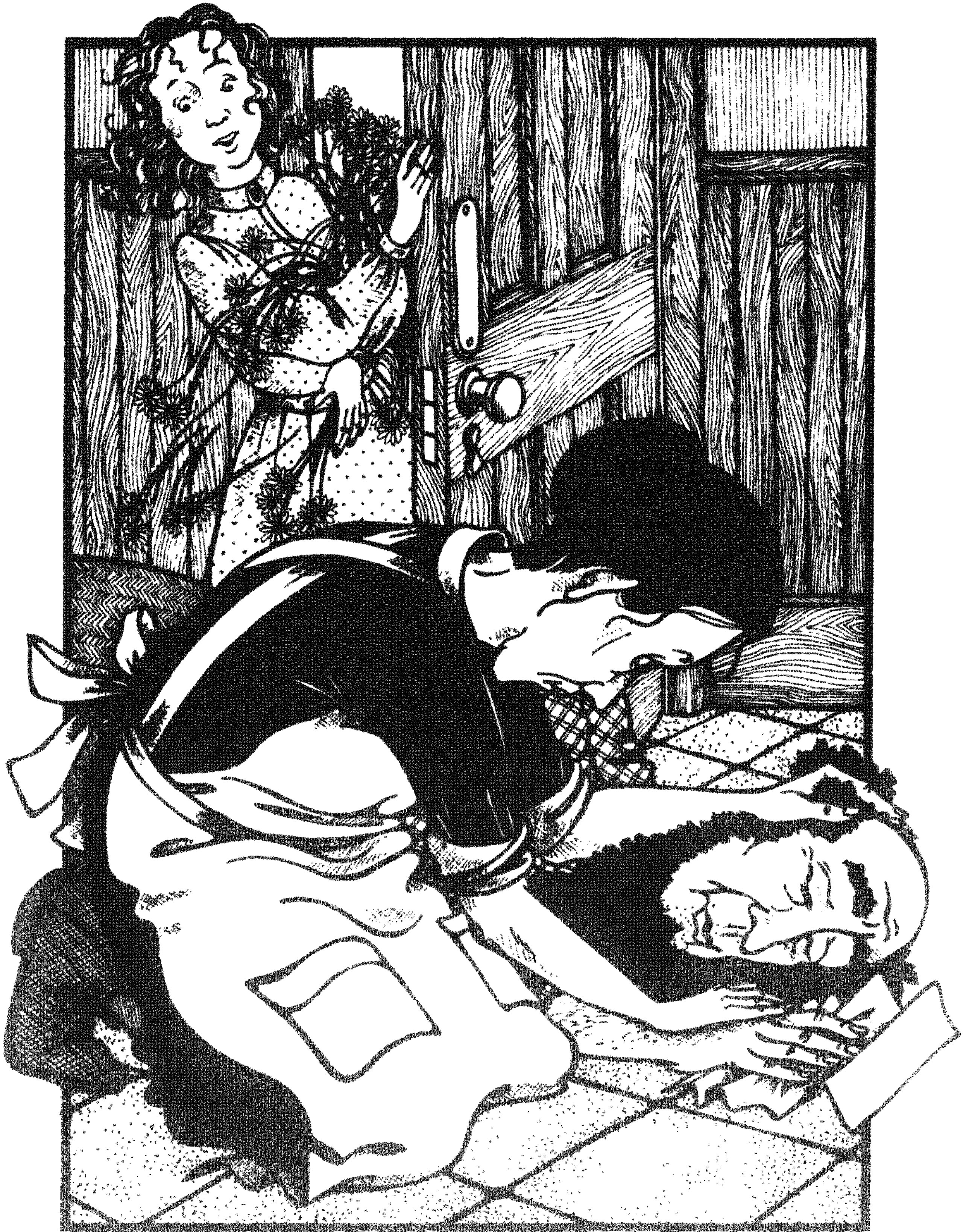
Anne dropped her flowers and ran to help Marilla.