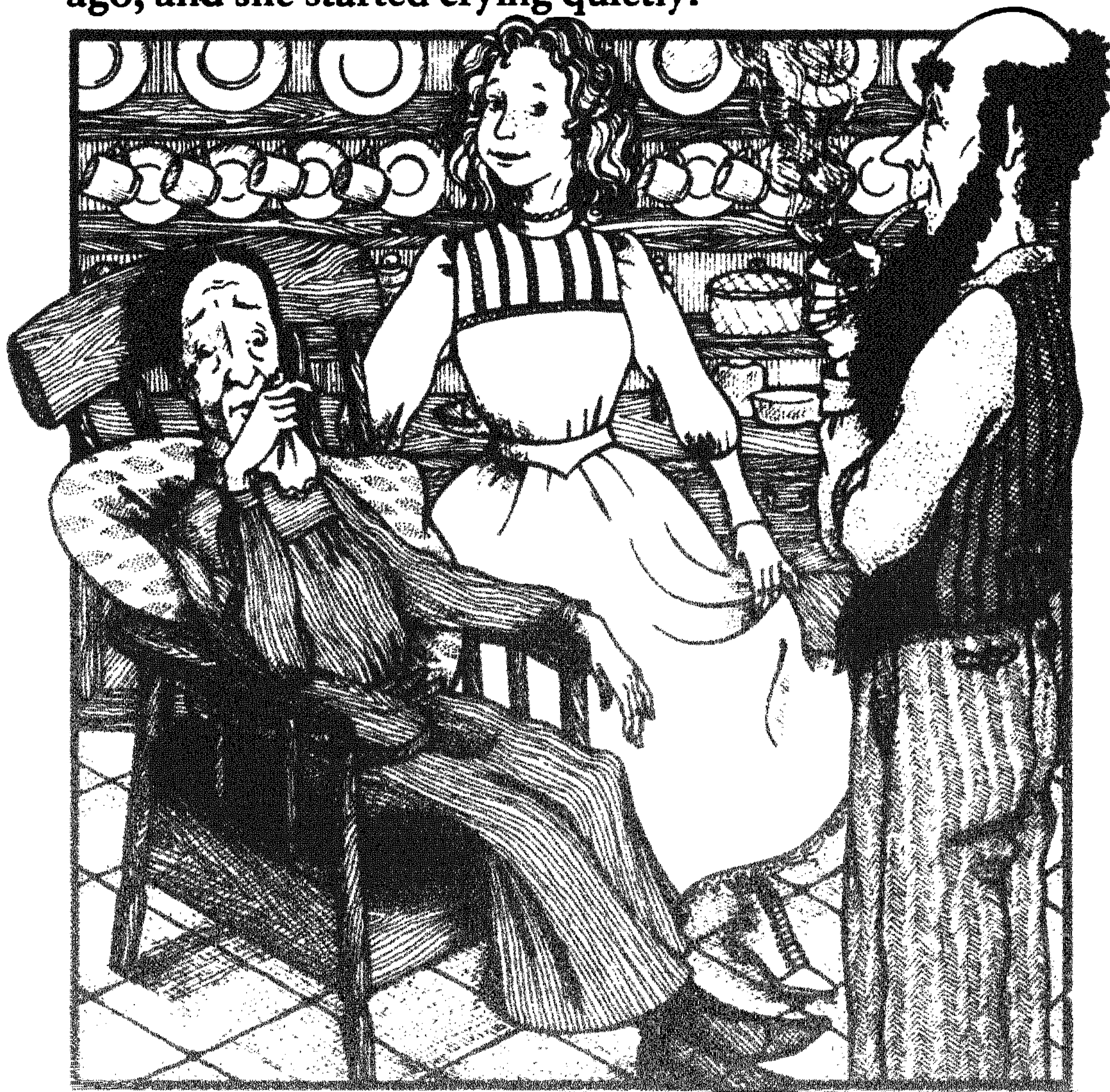
Anne put on one of her new dresses to show Matthew.

The evening before she left, she put on one of her new dresses to show Matthew. Marilla watched the happy young face. She remembered the strange, thin little child, with her sad eyes, who arrived at Green Gables five years ago, and she started crying quietly.